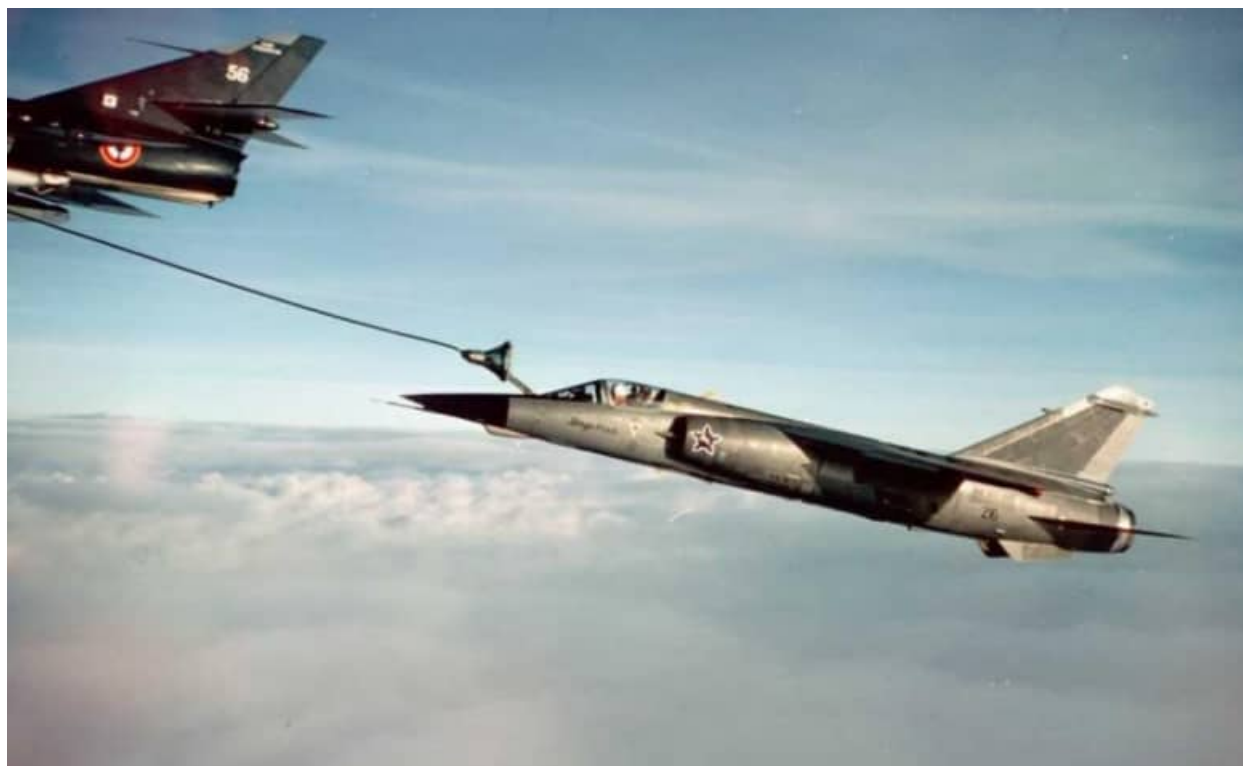
#216 performing refueling trials with, most likely, a French Navy Etendard IVP. In this case, the entire nose has been painted black and the SAAF Castle with gold Springbok added to the intakes..