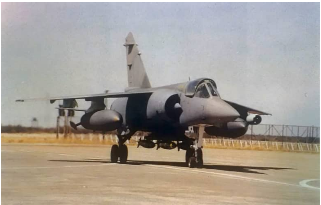
#244 was extensively used during the last months of the border war between August 1987 and March 1988. #244 is seen here at AFB Grootfontein taxiing out for a strike with four Mk. 82 bombs on the CLB.4 MER and an ACS pod on the port station 2 pylon.