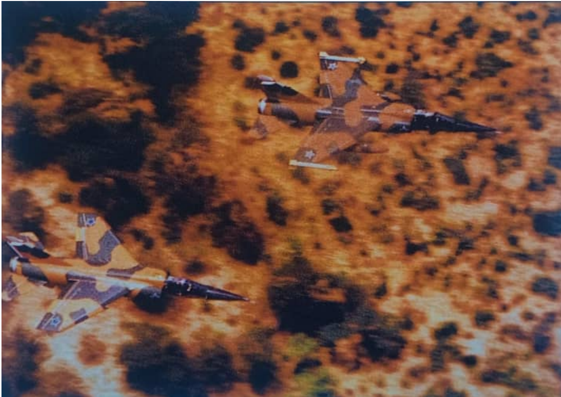
AZ camouflage scheme comparison between the nutria brown/green (top) and the standard buff/dark green (lower) colour schemes. Notice the satin sheen of the standard buff/dark green paint scheme. On the nutria brown painted aircraft, the original untouched dark green has a satin sheen whereas the nutria brown is a matte finish.