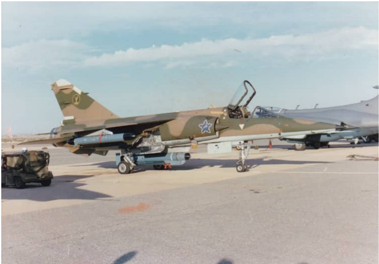
AZ #242 was also as used for the H2 glide bomb trials at Upington.