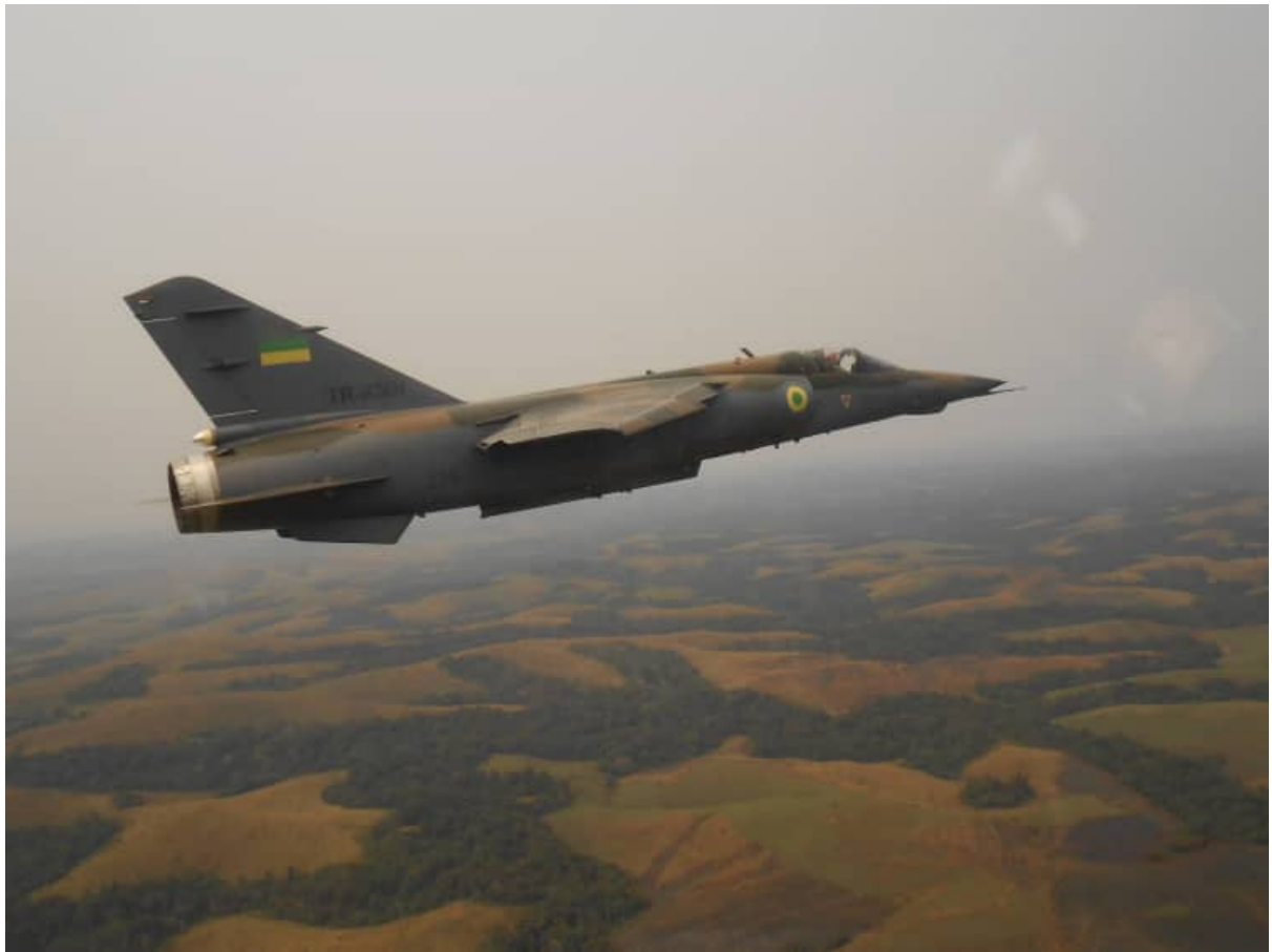
AZ #236 / TR-KMN