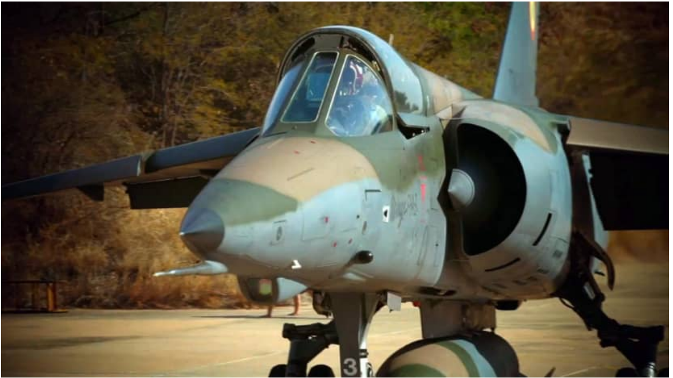
This one would appear to be AZ #232 / TN-365. Note the Congo -Brazzaville roundel on the vertical stabilizer and the "32" on the upper intake.