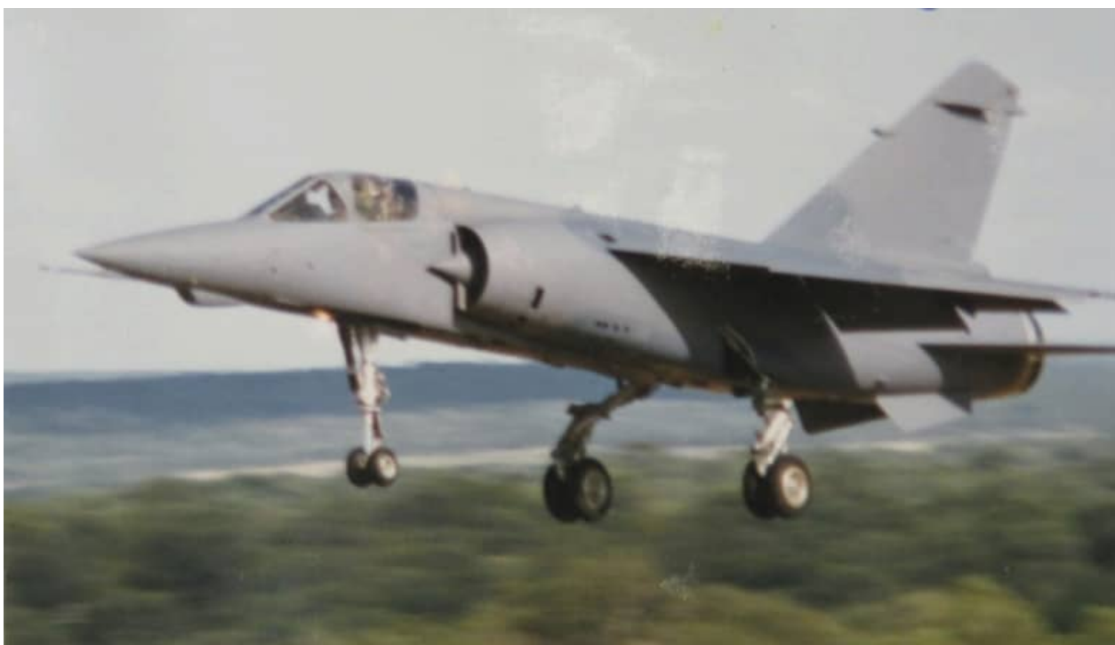
#243 giving a display at a Hoedspruit open day 31 January 1986. The aircraft has not been upgraded with RWS nor the RIMS ventral fins. All antennas on the vertical stabilizer have been overpainted