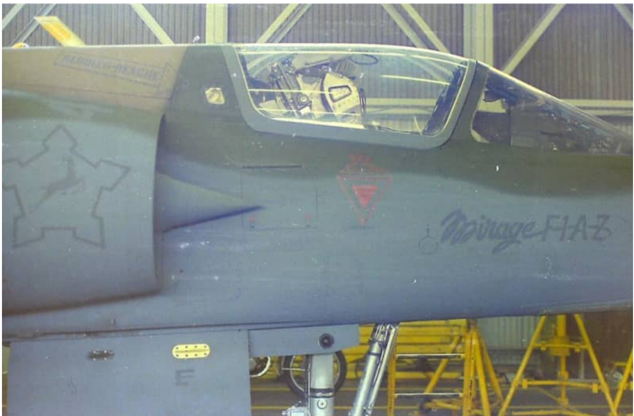
This AZ has the canopy frame painted in medium blue-grey. Low visibility markings have been applied. There is no dark grey leading edge to the intakes. The yellow antennas on the nose gear door is the lower IFF antenna. Note the black RWS button antenna on the small nose gear door and the black RWS blade antenna on the larger nose gear door.