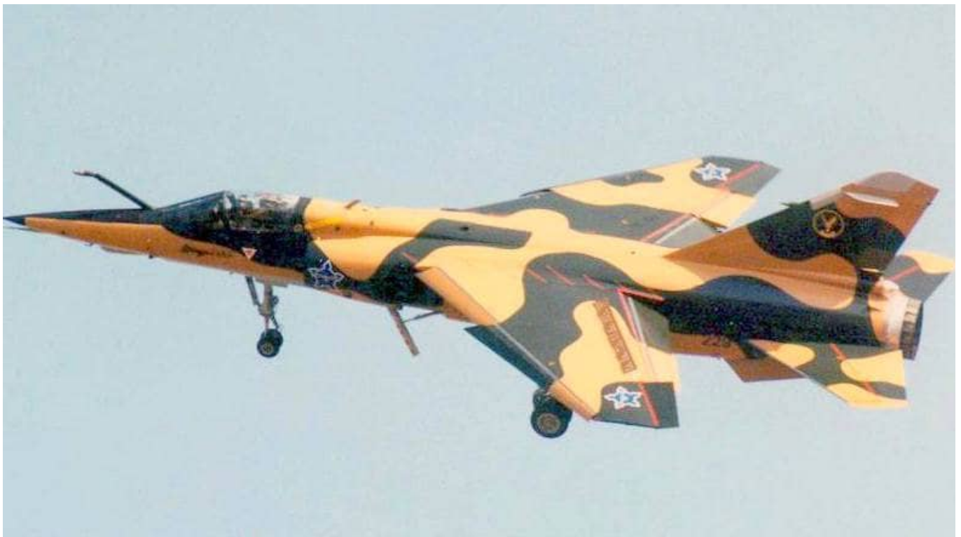
AZ #229 with pattern 1. Red warning stripes are visible on wings, horizontal stabilizers and wing/fuselage junction. This aircraft has had the locally developed Radar Warning System (RWS) antennas installed (refer to Volume 1 for details of the AZ RWS). Note the black antennas on the lower nose aft of the laser designator. It also has had the Eagle replacing the Springbok inside the Castle. The spoiler on the left wing is deployed turning the aircraft left.