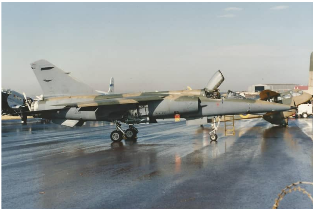
Below - low visibility Castles with dark grey edges and dark grey Springbok.