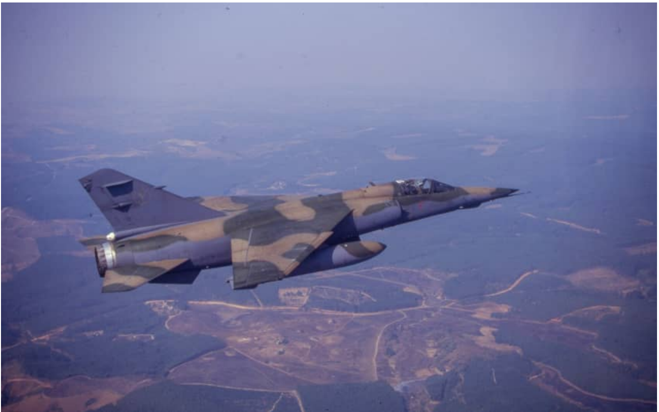
F1AZ #225. Note the "25" above the starboard intake in the same blue-grey as the fuselage. The national insignia appears to be the low visibility Castle/Springbok. The Castles on the upper wings are barely visible and comprise blue Castle with grey border and gold Springbok. No Mirage F1AZ on the nose.