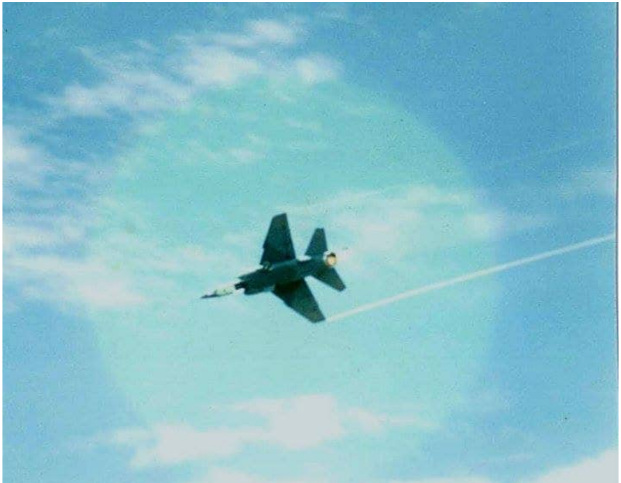
A false canopy painted in white was applied to #244. The reasoning being that the colour contrast rather than the colour itself is responsible for creating the illusion.