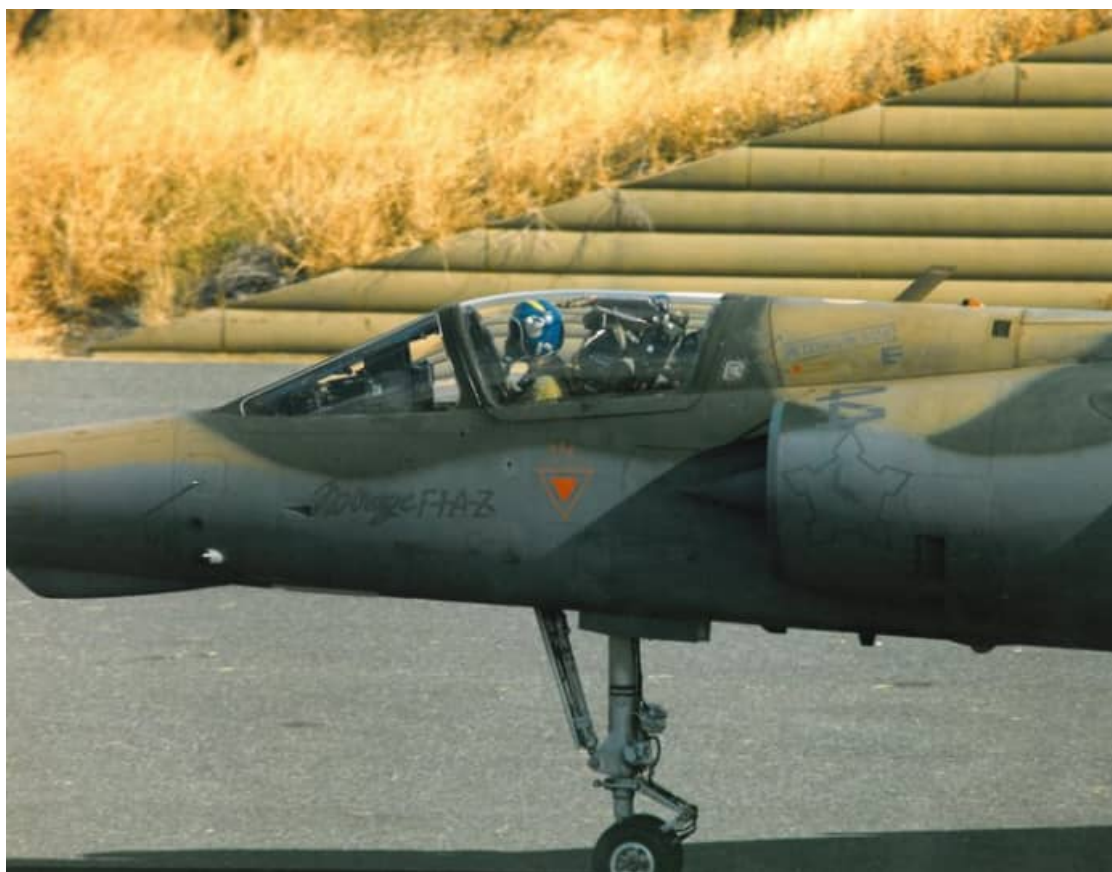
AZ #244 with low visibility markings including the Castle/Springbok insignia. The UHF blade antenna is also camouflaged. Note the dark grey leading edge to the intake. The "44" above the intake is applied in dark grey. The upper UHF antenna has been painted in dark earth. All other markings have been applied in subdued colours.