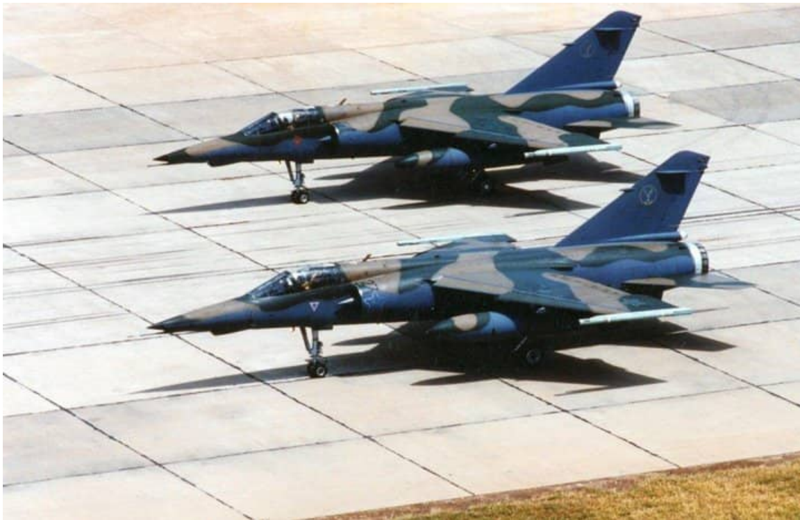
AZ #227 and friend. #227 has the high visibility blue Castle with gold Springbok markings, whereas the other AZ has the later low visibility Castles with Springbok. #227 has the "27" digits on the upper intake in black, whereas the other AZ's numerals are in dark grey. It is apparent that the camouflage patterns were loosely applied showing some variations between the two aircraft.