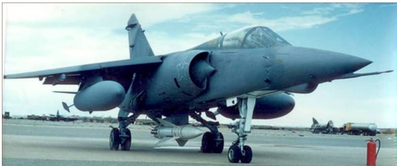
#244 armed with an AS-30 missile at Upington in December 1987.