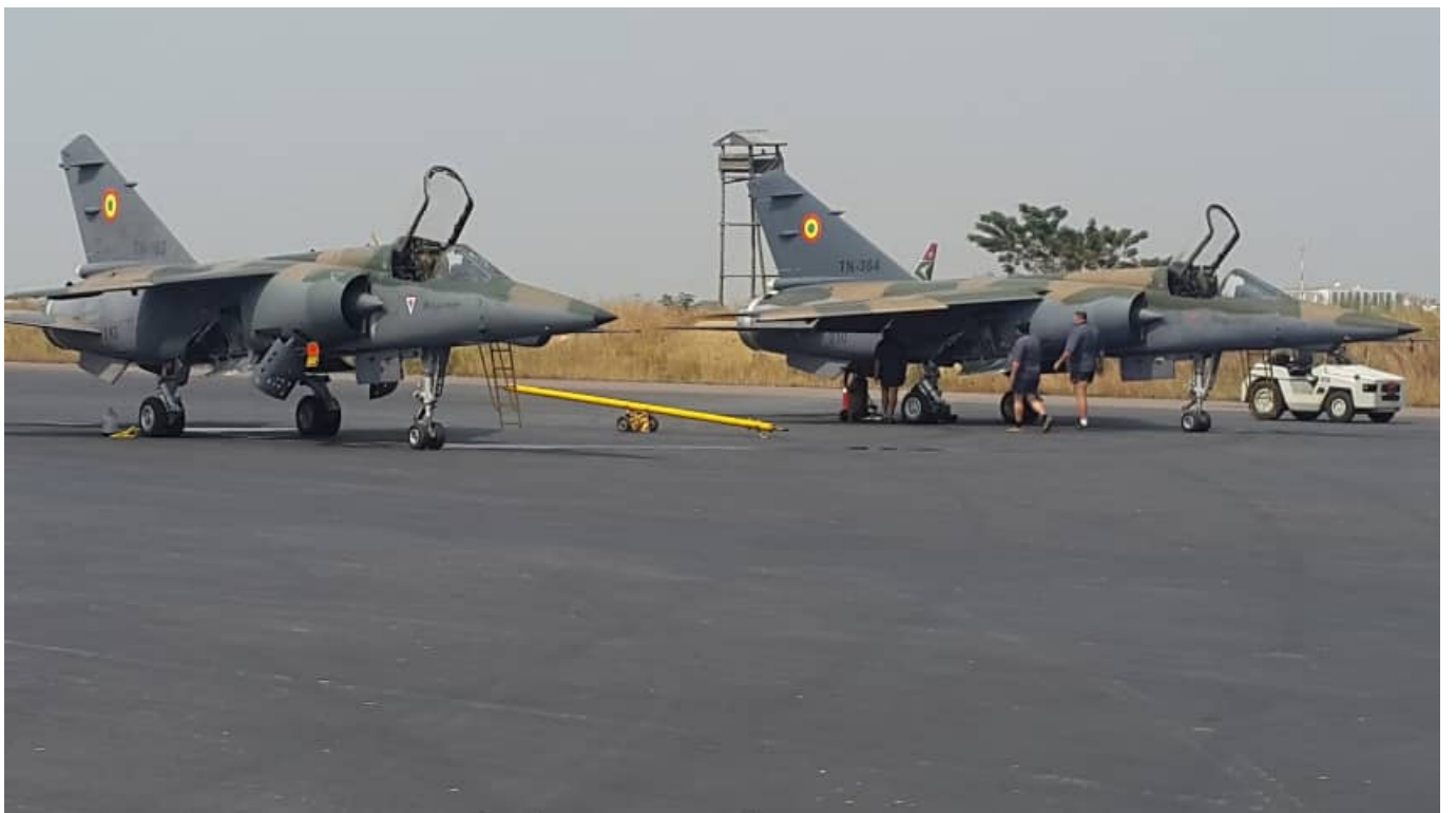
AZ #243 / TN-363 and AZ #230 / TN-364.