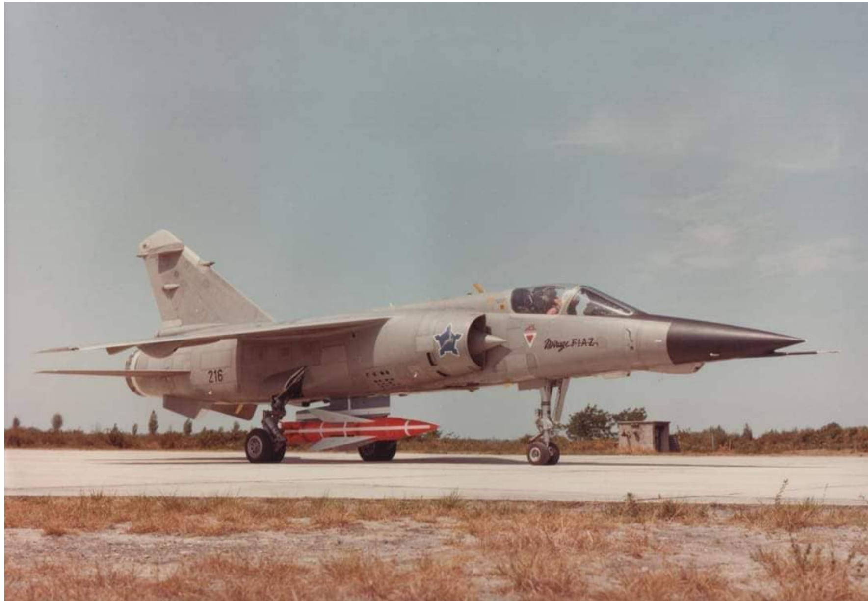
#216, the prototype SAAF AZ, carrying a test AS-30 air to surface missile for trials in France. Note the test camera in a rectangular fairing located just forward of the nose landing gear.