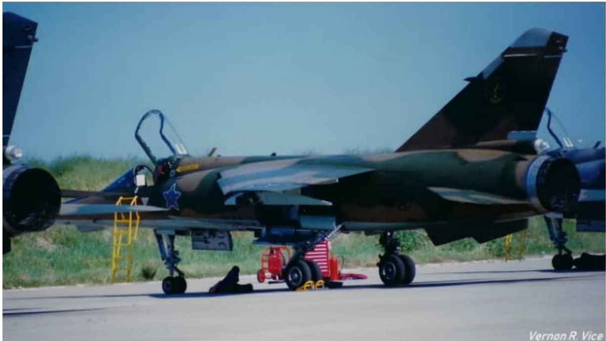
AZ #217 at Langebaanweg. Aircraft has both RWS and RIMS systems installed.

Eventually, at least eight aircraft were formally repainted in this scheme. The tail numbers identified are: 217, 224, 231, 234, 235, 240, 241, and 242. They are shown in the photos on the following pages.