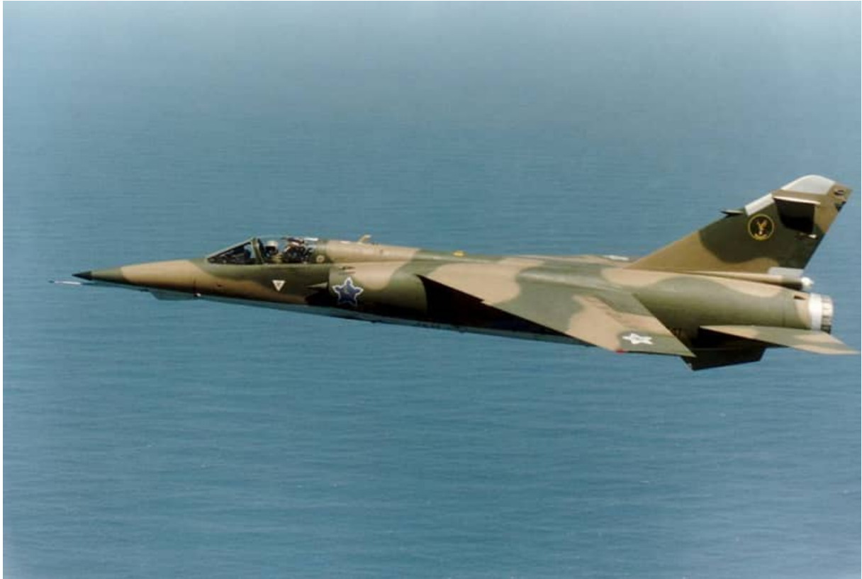
AZ #241. No black anti-glare panel ahead of the windshield. Compare this port side image to that of #234 - #241 has the forward section of the nose painted green. Note that #241 is not carrying the distinct yellow rescue arrow aft of the canopy.