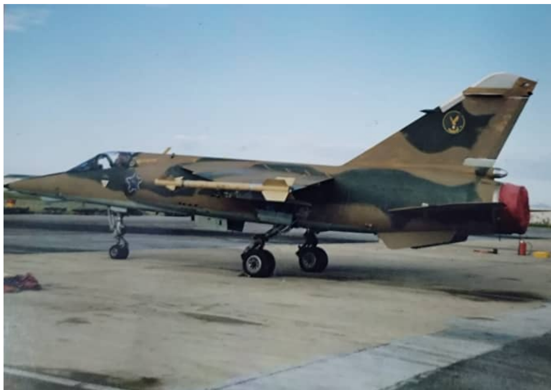
One of the Grootfontein-repainted AZs is seen on the flight line after repainting. Note the rough overspray covering all buff surfaces, even obscuring the tail number. The high-visibility national markings on the aircraft's rudder have also been overpainted.