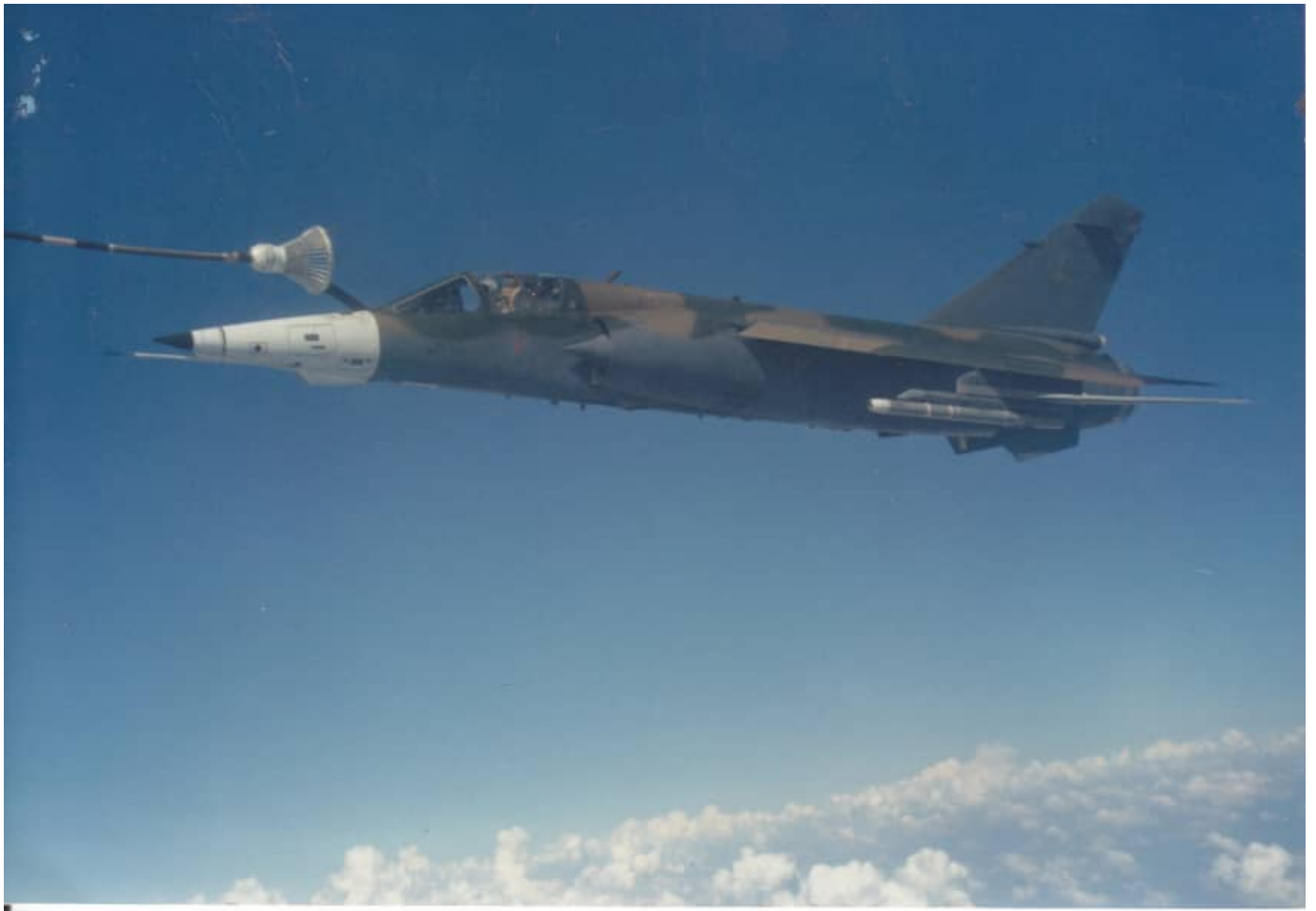
This AZ with white nose and horizontal stabilizers is carrying a captive V3S missile body on the port outboard wing station.