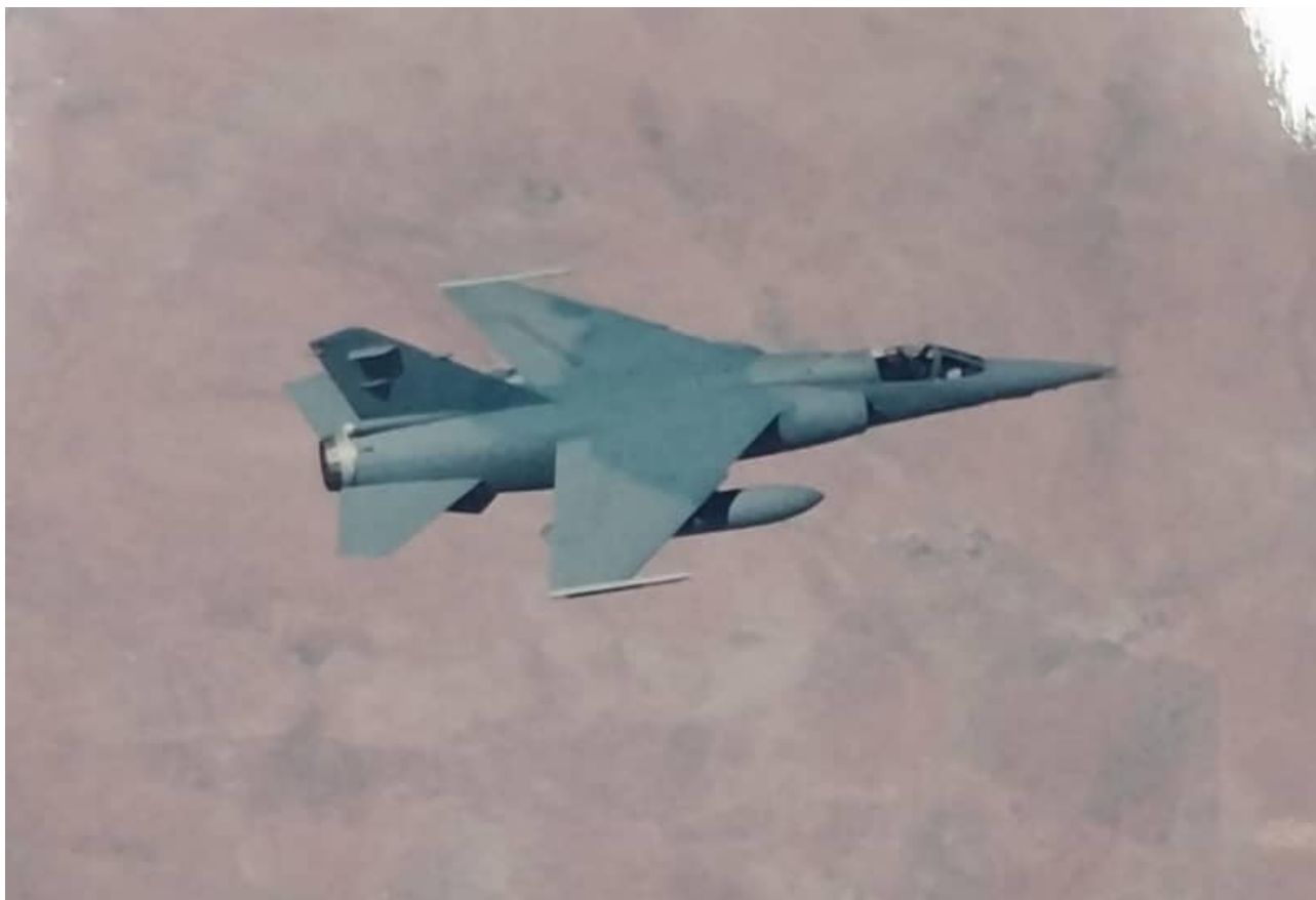
Topside view of AZ #243. She was painted after 244 when it was realized the AZ needed a slightly darker camouflage scheme than the air-superiority camouflage scheme from the F1CZ. The Highveld Grey extremities and PE Blue colours were replaced by what appears to be a darkened version of Highveld Grey.