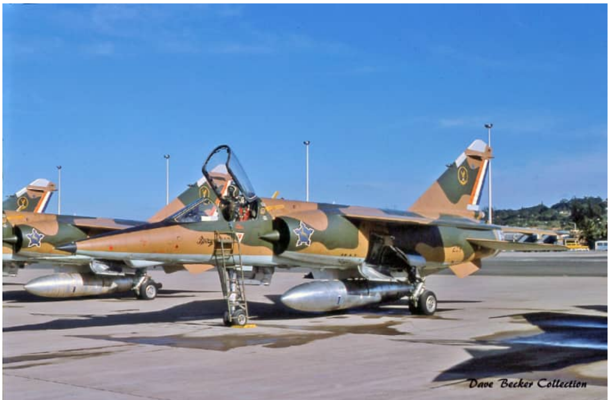
AZ #239 looking very neat. The highly polished external fuel tank is the RP35 of 1,200 liter capacity. The underside colour is clearly pale blue as opposed to light grey.