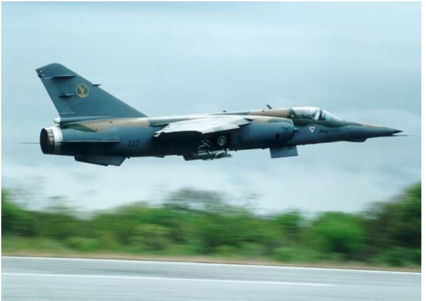
AZ #227 heading off in clean configuration. Both RWS and RIMS features can be clearly seen.