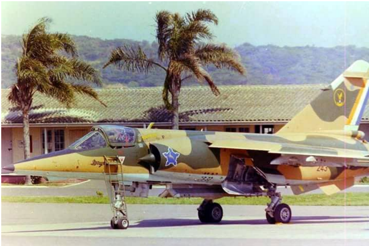
AZ #243 appears to be in painted in pattern 2. The large yellow blade antenna on the spine is the main UHF antenna and the smaller one aft of this is the upper IFF antenna. The yellow antenna on the rear underside between the ventral strakes is the AS30 air to ground missile communication antenna. #243 is in pre-RWS mod state.