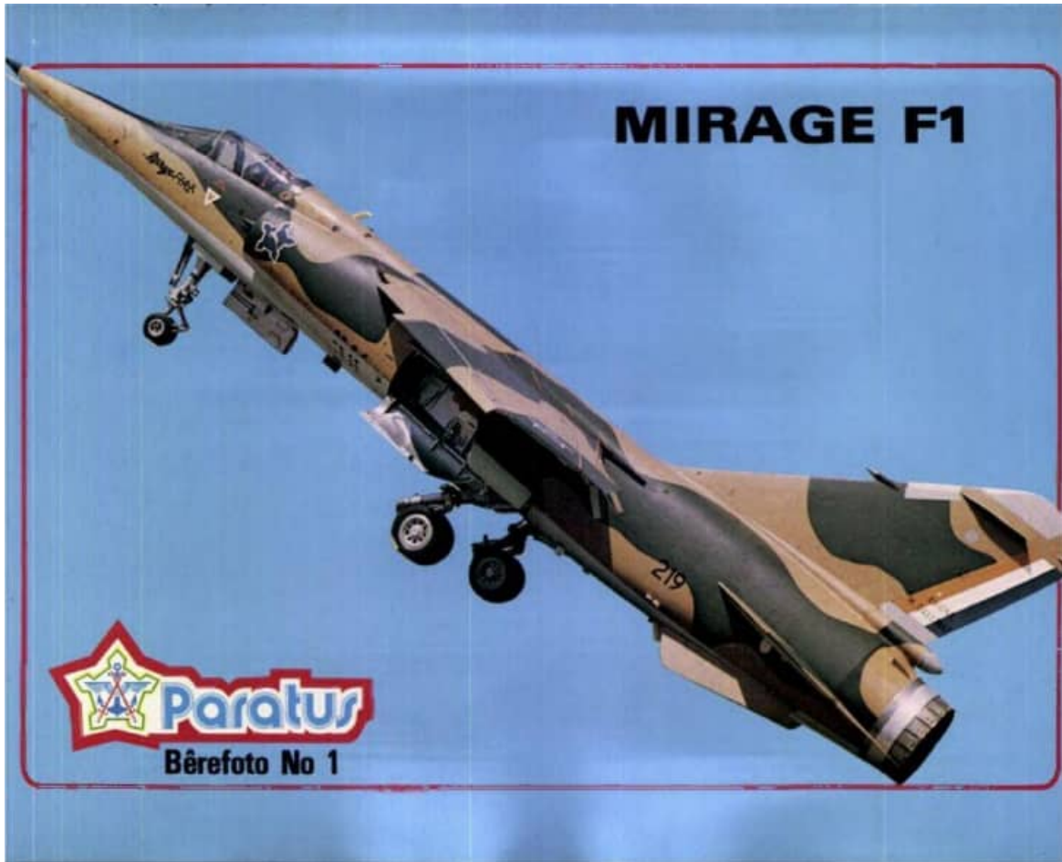
Got to love this one !!! "Berefoto" indeed. AZ #219. Of interest in this photo is the difference in paint hue between the rear fuselage and the exhaust cone section.