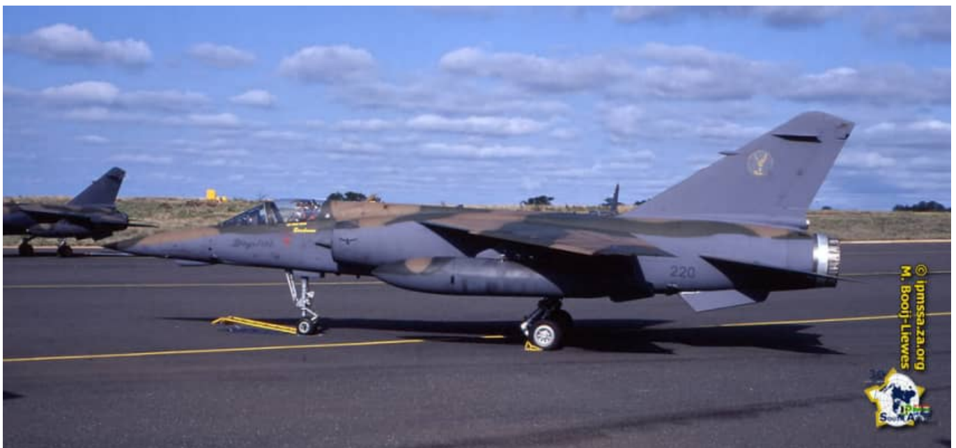
Tail number 220 at retirement. The vertical stabiliser is now entirely in dark coastal blue grey , including the various antennas. The UHF and IFF antennas have been overpainted in the local camouflage colour. The tail number numerals have switched from black to dark grey. All national and squadron insignia are in low-visibility versions. The aircraft is now fitted with both RWS and RIMS.