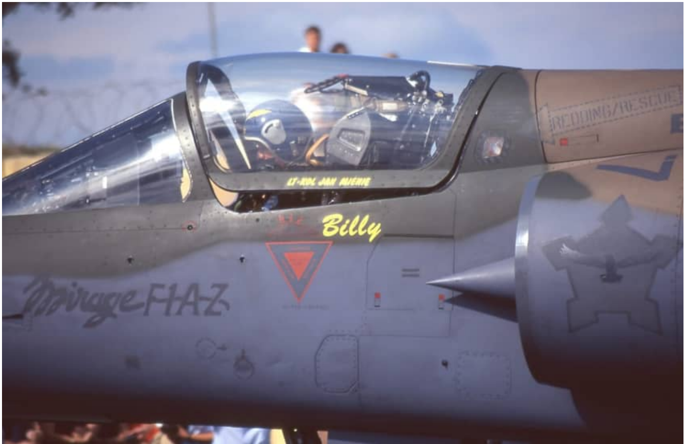
More AZ nose art, this time celebrating the "Billy Boys". Note how the ejection seat warning triangles and rescue arrows aft of the canopy have been differently applied to the two aircraft.