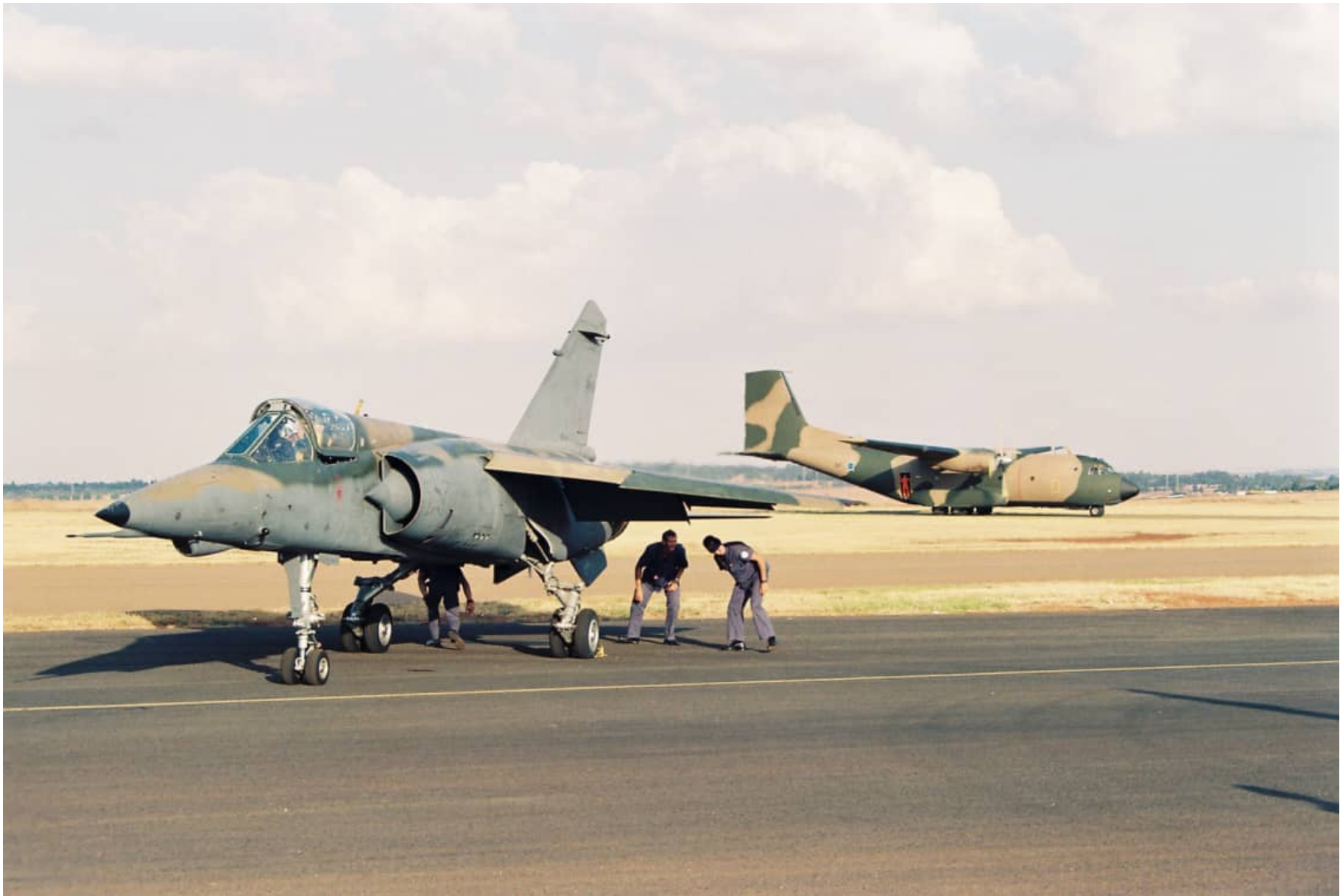
AZ #231 with another SAAF Border War icon in the background, C160Z Transall, seen at Swartkop Air Base.