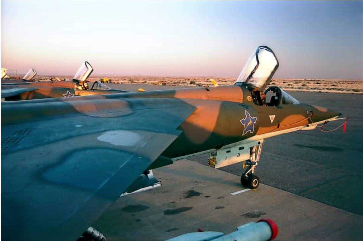
AZ #241 ("41" just visible on upper intake) at the Upington ACM camp (image dated 1989) in the foreground. The next aircraft is possibly AZ #231 and appears to be in the initial nutria/green scheme. Note that the dark earth/green demarcation on this aircraft is much more feathered than on #241. The dark earth on #231 extends forward on the upper fuselage to just behind the canopy. Both aircraft do not have the prominent yellow rescue arrow aft of the canopy. Also notice the lack of a black anti-glare area on the nose. UHF and ILS blade antennas on the fuselage spine remain in the original yellow colours. #241 is carrying what looks like a captive V3B missile body on the wingtip rail – note the lack of typical V3B canard fins