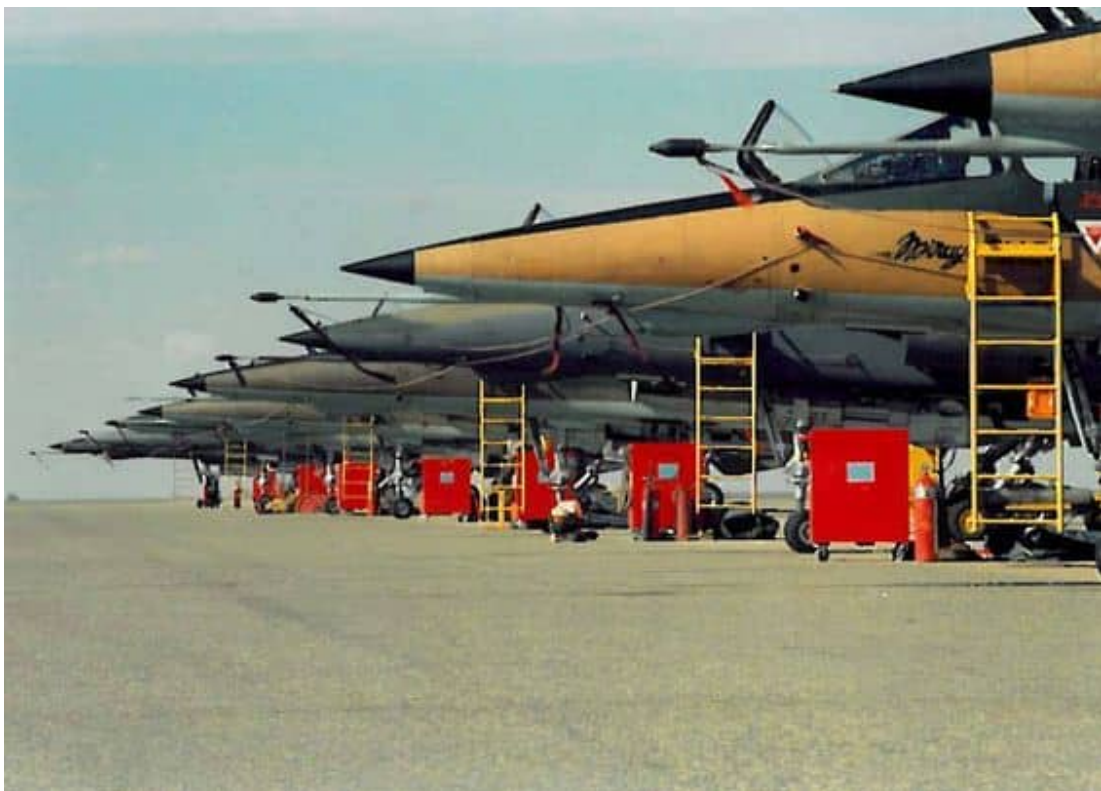
Another lineup of 1 Squadron AZs. In this case, the front two aircraft are in the original buff/dark green scheme. The third aircraft is in the final dark earth/green/blue-grey scheme. The next two aircraft appear to be in the interim brow/green/pale blue scheme – note the hard demarcation between the upper colours and the underside pale blue. These aircraft also appear to all be post-RWS mod state.