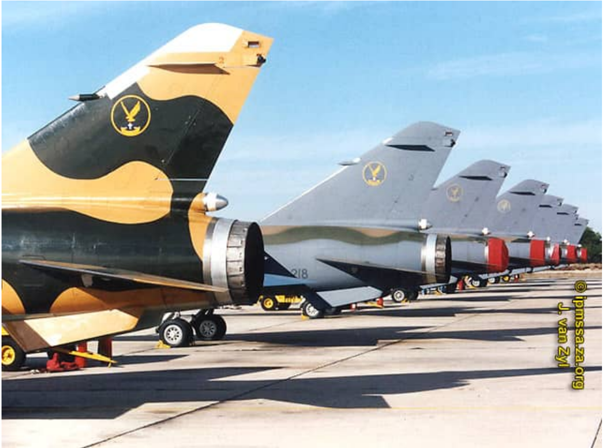
Lineup of 1 Squadron F1AZs. They are all post-RWS mod state. The one on the left is in the original hard-edge buff/dark green camouflage – the finish appears to be quite glossy which may indicate that this is the display aircraft, #229. #218 and the others are in the final matte dark earth/green/blue-grey scheme. Note the natural metal leading edge on #218's vertical stabilizer and the various hues of metal on the exhaust area. The forward section of the drag chute cone is white, the rear section unpainted. Another peculiarity of the buff/dark green aircraft is that the VHF antenna beneath the rudder has been painted dark green.