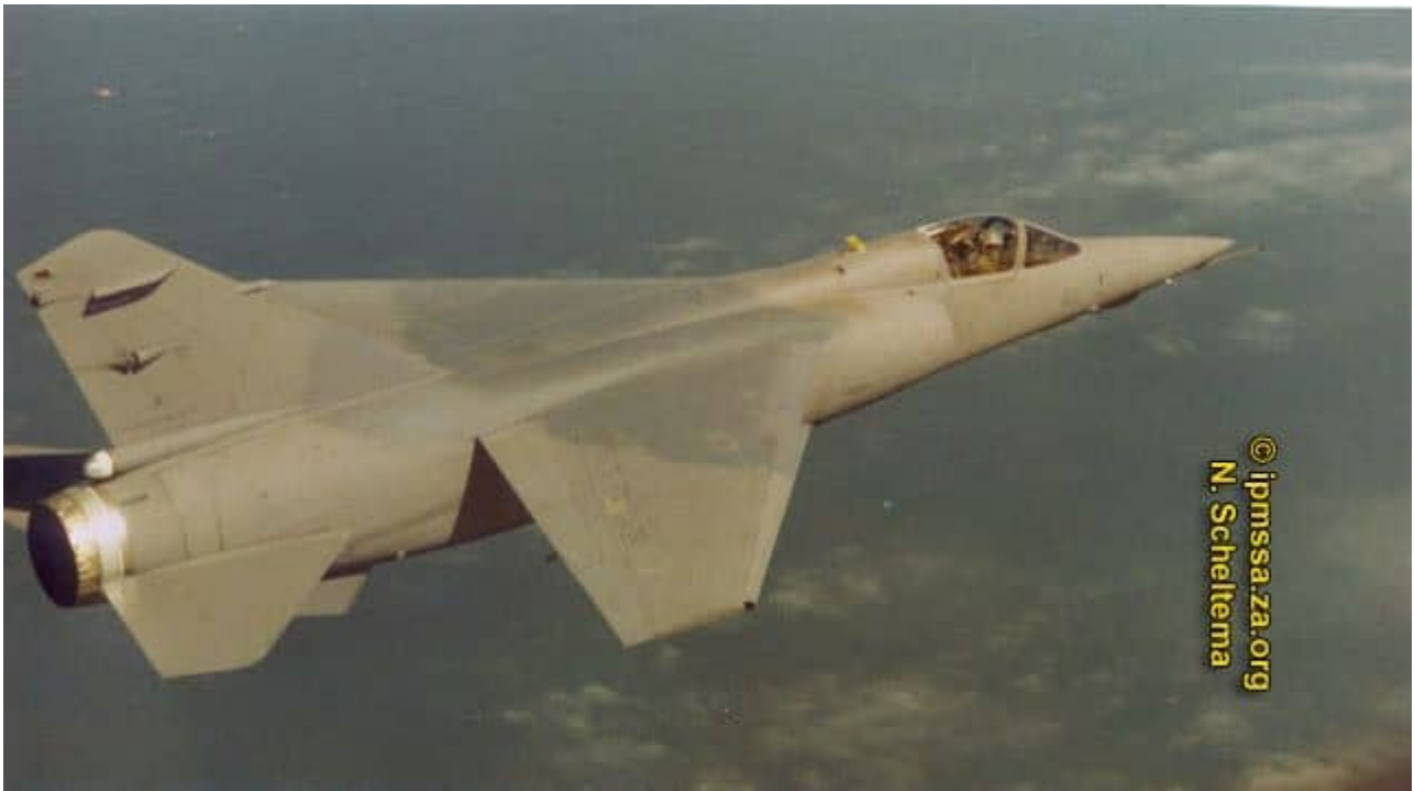
#243 was later upgraded with RWS and RIMS ventral fins while still in the experimental camouflage scheme. By this time the colours were very faded. Note the paint spill on the port wing has by this time been corrected.