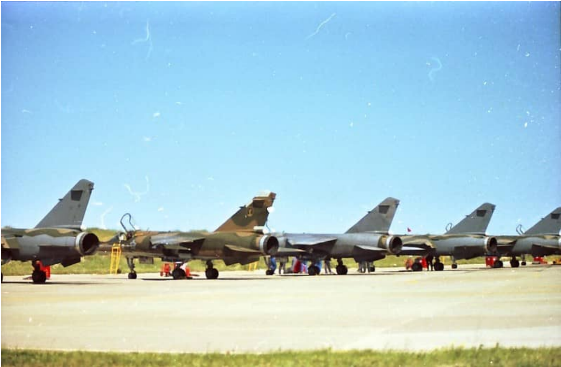
Great image of several AZs in various states of camouflage. The AZ on the left and the two on the right are finished in the final dark earth/green/blue-grey camouflage. None of these have the 1 Squadron badge applied to the vertical stabilizer. The second AZ from left is painted in the interim dark earth/green camouflage scheme and appears to be carrying full high visibility SAAF markings. Note the variability of the green colour, especially at the tail pipe area. The third AZ from the left is #244 painted in the three-colour low visibility blue-grey camouflage but has had a replacement tail pipe section fitted, which is painted similar to the aircraft to its left.