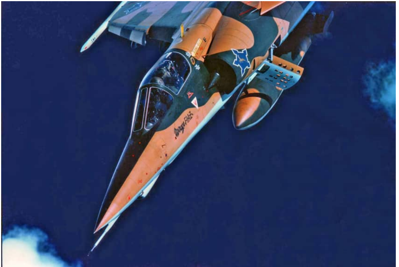
Beautiful image of the business end of an AZ. This AZ is finished in pattern 1. The underside colour is pale blue (not grey). The outboard leading-edge slat is extended and the inboard leading-edge flap is in the lowered position. Note the yellowish sealant around the edges of the canopy and windshield. The antiglare panel and the buff colour extend to the tip of the nose and the nose cone for the ranging radar appears not to be present. This could indicate that a ballast nose has been installed. The wingtip missile rail is light grey (typical for both the AZ and CZ). Note the standard NATO airframe servicing stenciling on the nose in bright orange.