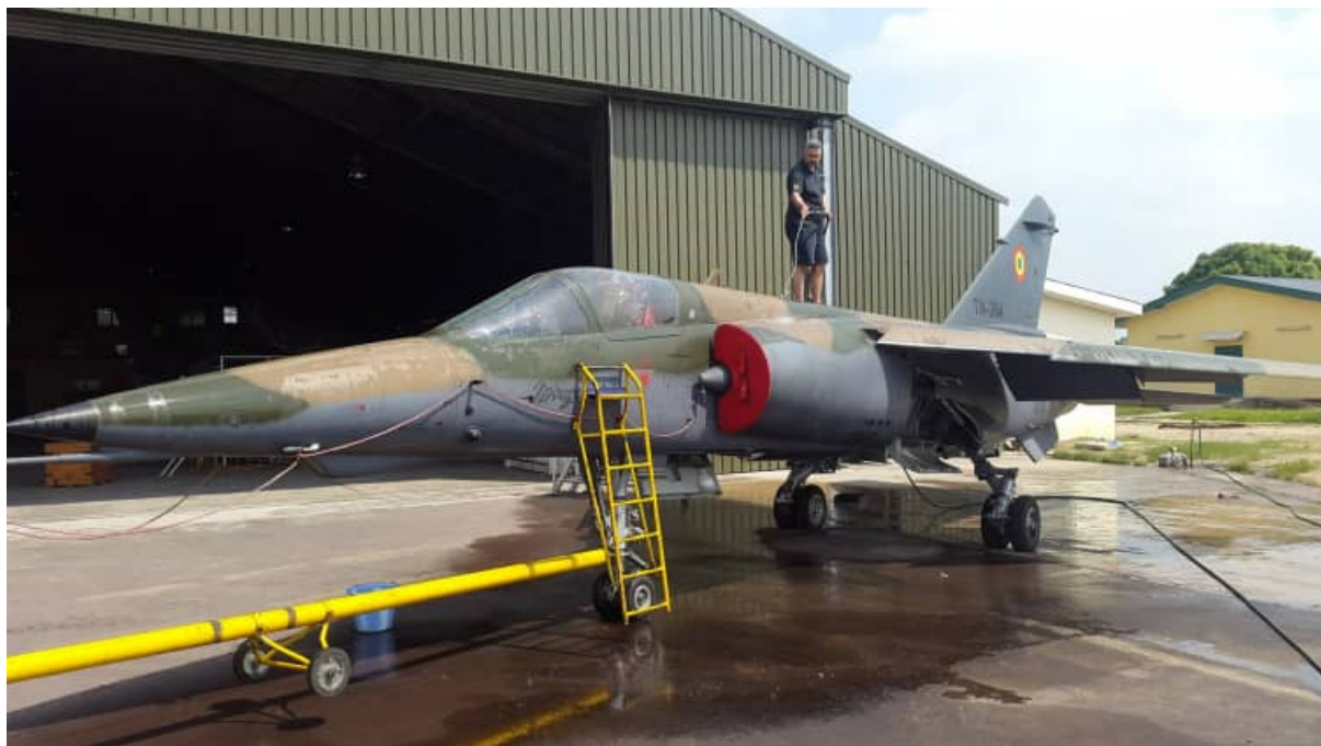
AZ #230 / TN-364