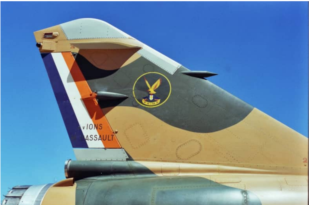
AZ vertical stabilizer detail. This is the original hard-edge buff/dark green camouflage scheme. Note the partially weathered "AVIONS M.DASSAULT" text on the rudder in the image above. The starboard rear RWS antenna can be seen at the top trailing edge of the vertical stabilizer. The drag chute cover is missing.