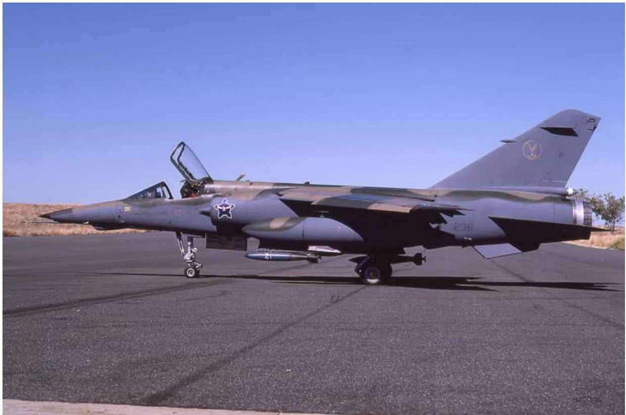
AZ #236 with high visibility blue Castle and gold SAAF Eagle. All other markings are of the low visibility type. The blue Castle may have been added to #236 along with the yellow pilot's call sign and surname to celebrate a special occasion, possibly part of the AZ's retirement.