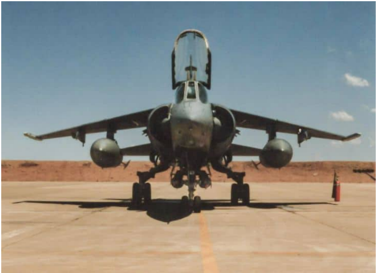
#243 had a false canopy applied in black. She is seen here during a bombing camp at AFB Bloemspruit in 1986/7.