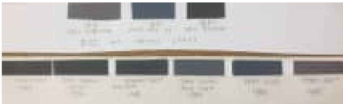
Various blue and grey shades as developed over the years by Ron Belling. At the top are the three colours of the F1CZ camouflage (dated 1981). At bottom, from left to right: Shadow Grey, Pale Shadow Grey, Mirage Grey (same as above) Dark Coastal Blue Grey, Berg Blue, Vaal Grey

During the 1980s, several projects were undertaken to develop new camouflage schemes better suited to the operational conditions experienced over Angola during the border war. Following the successful project to develop a new air-superiority-oriented paint scheme for the F1CZ in 1981, Ron Belling (renowned South African aviation artist) continued building on the CZ low visibility colour groundwork done by Geoff Timms 3 by developing new shades of blue and grey. As with the three colours of the CZ scheme, these new colours were local formulations using SABS colour codes. There are no direct equivalents from the US FS (Federal Standard) or UK BSC (British Standard Colour) paint colour systems 4 .