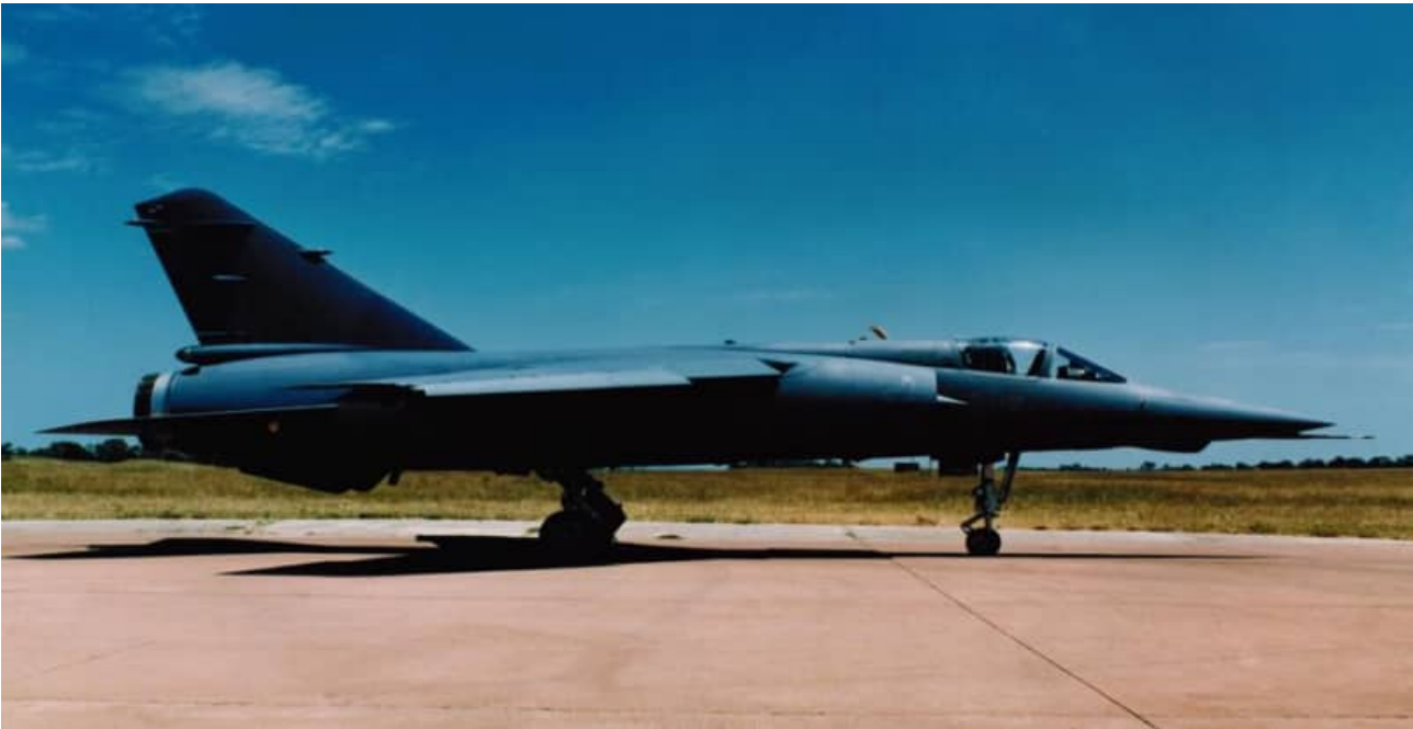
Another view of #243 with the old RWR BF antennas clearly visible on the vertical stabilizer, pre-RWS upgrade, as well as the AS-30 command guidance antenna visible just ahead of the ventral fins.