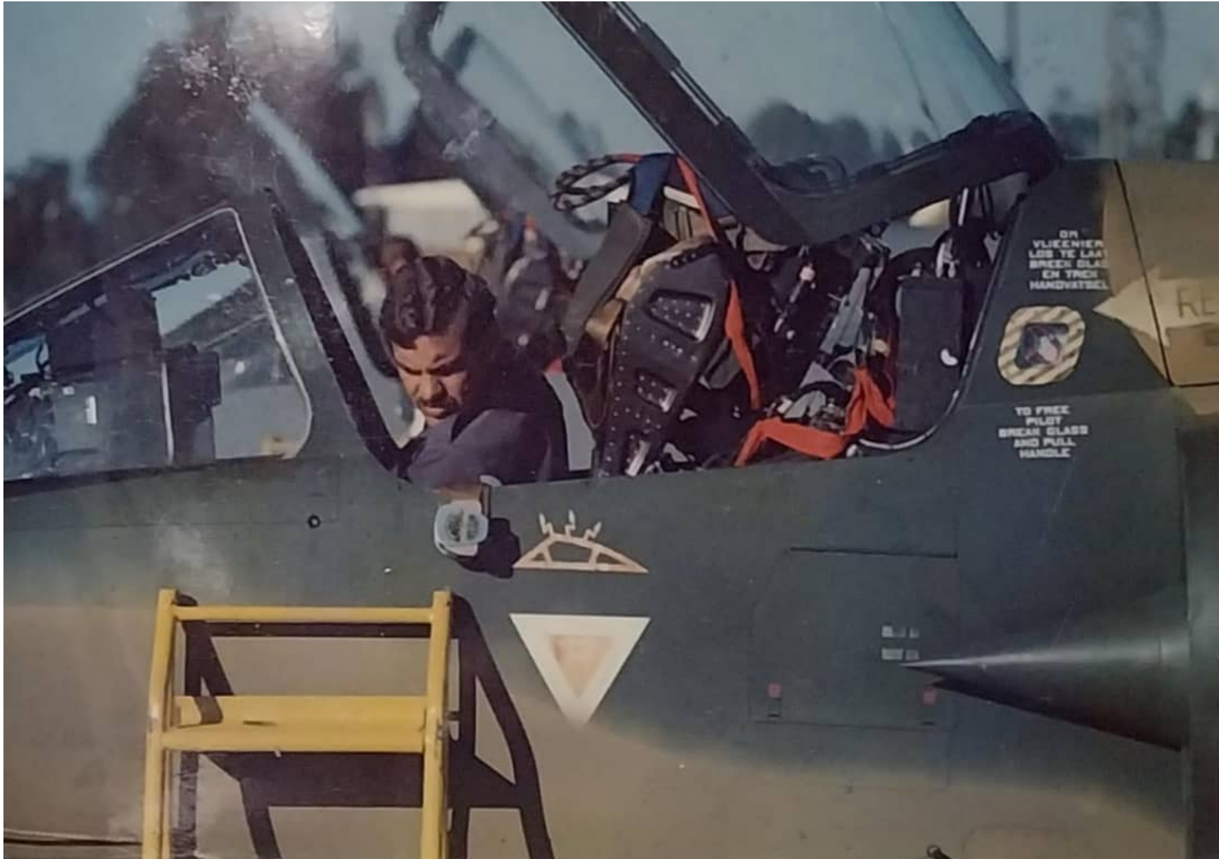
"A little rough" as remarked in the Squadron diary is an appropriate description of the first paint jobs, but it got the job done. Note the partial overspray of nutria brown on the ejection seat warning triangle and the slightly oversprayed "rescue" arrow aft of the canopy. In this area the hard edge between the original buff and dark green colours is clearly visible.