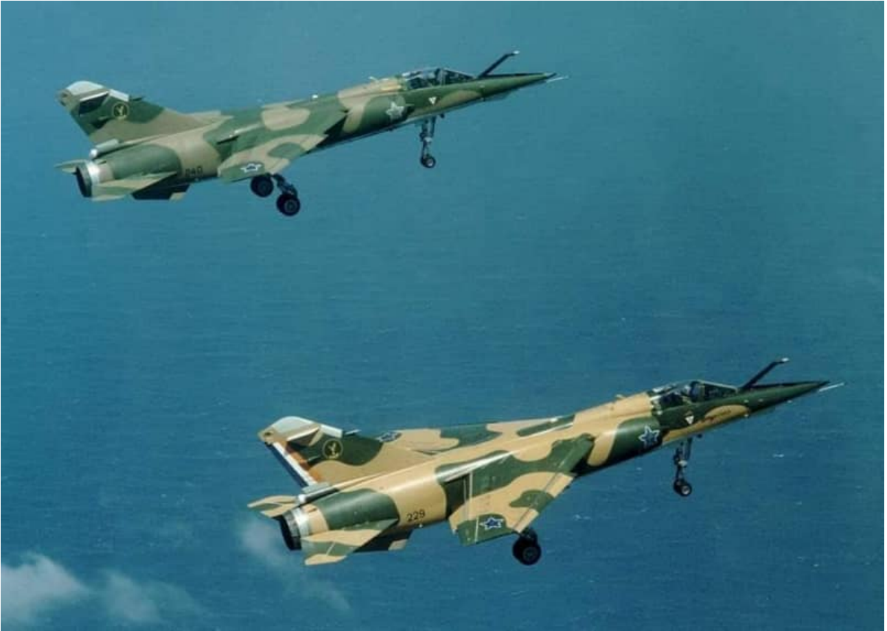
Great image showing AZ #229 in the original hard-edge buff/dark green camouflage and AZ #240 in the matte soft edge dark earth/green camouflage. Both aircraft have the standard high visibility markings applied. #229 is painted in the AZ pattern 1 scheme whilst #240 is in AZ pattern 2 scheme.