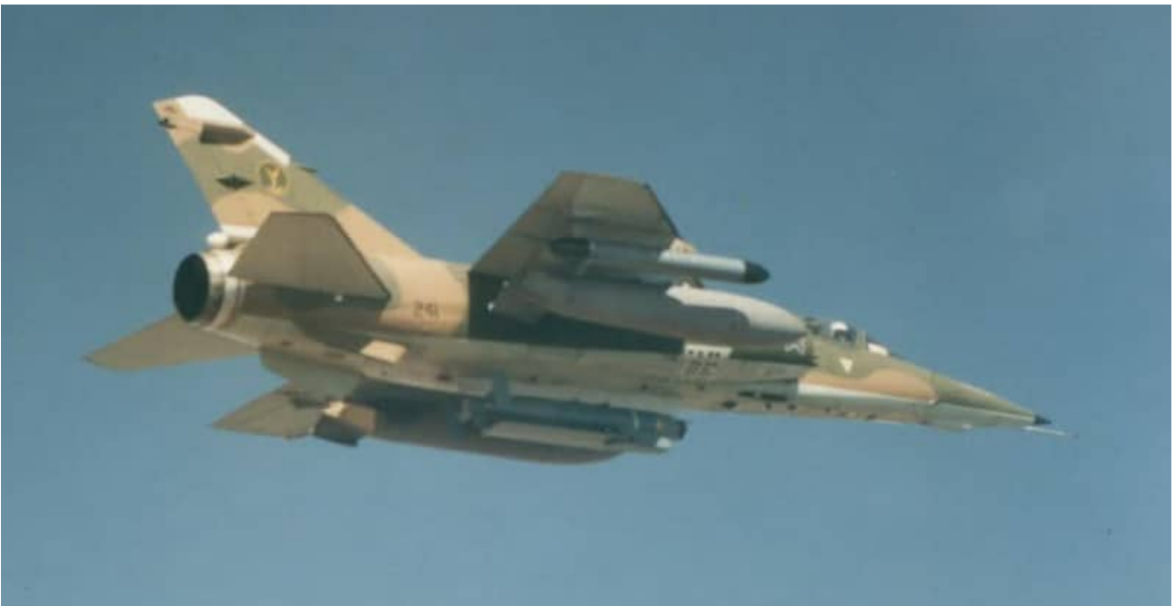
SAAF Castles were not applied to the lower wing surfaces of those AZs painted in the interim dark earth/green/pale blue colour scheme as can be seen in this image of #241.