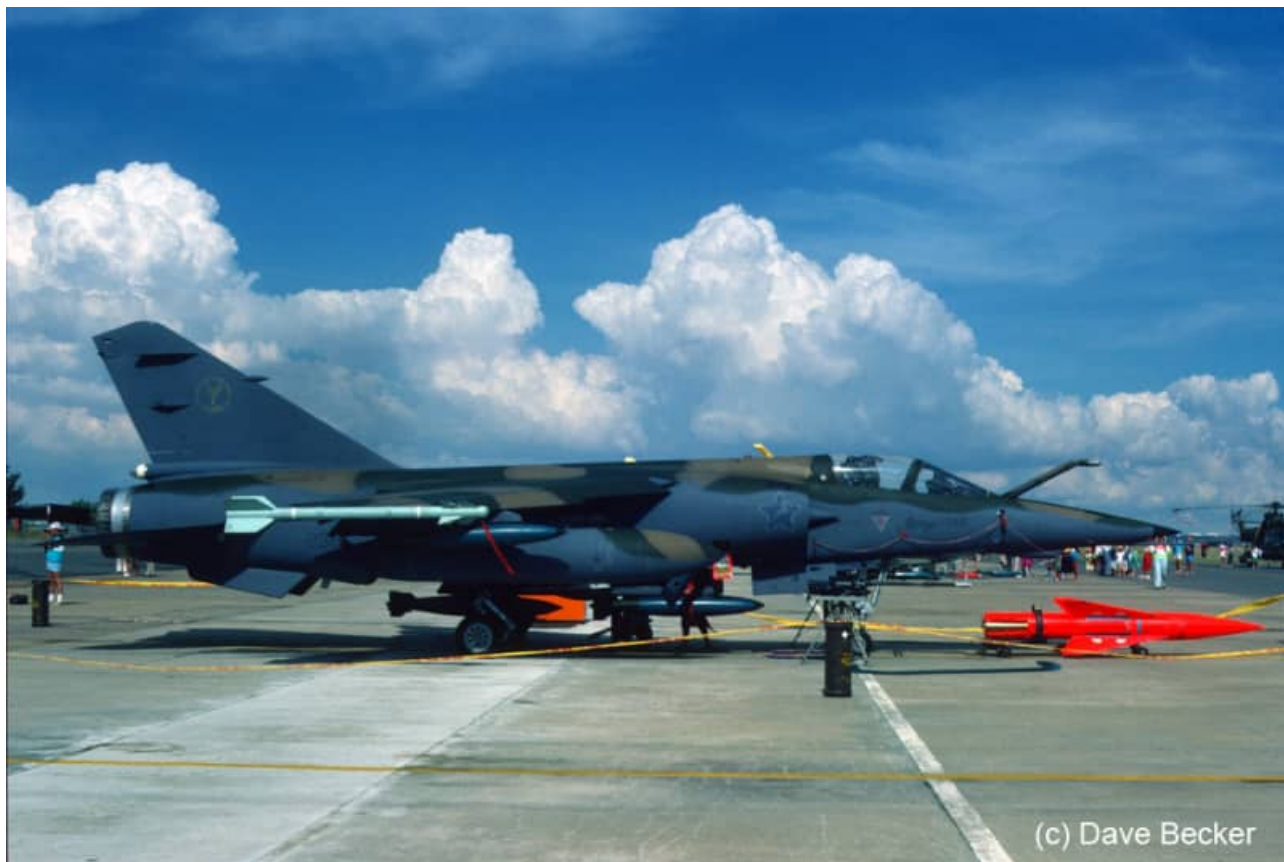
Above - blue Castles with gold edges and Springbok.

Regarding the national insignia, there were several permutations :