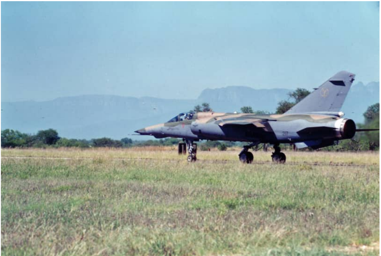
AZ #217 at Hoedspruit AFB. Markings include Castle/SAAF Eagle combination, 1 Squadron badge and Mirage F1AZ on the nose.