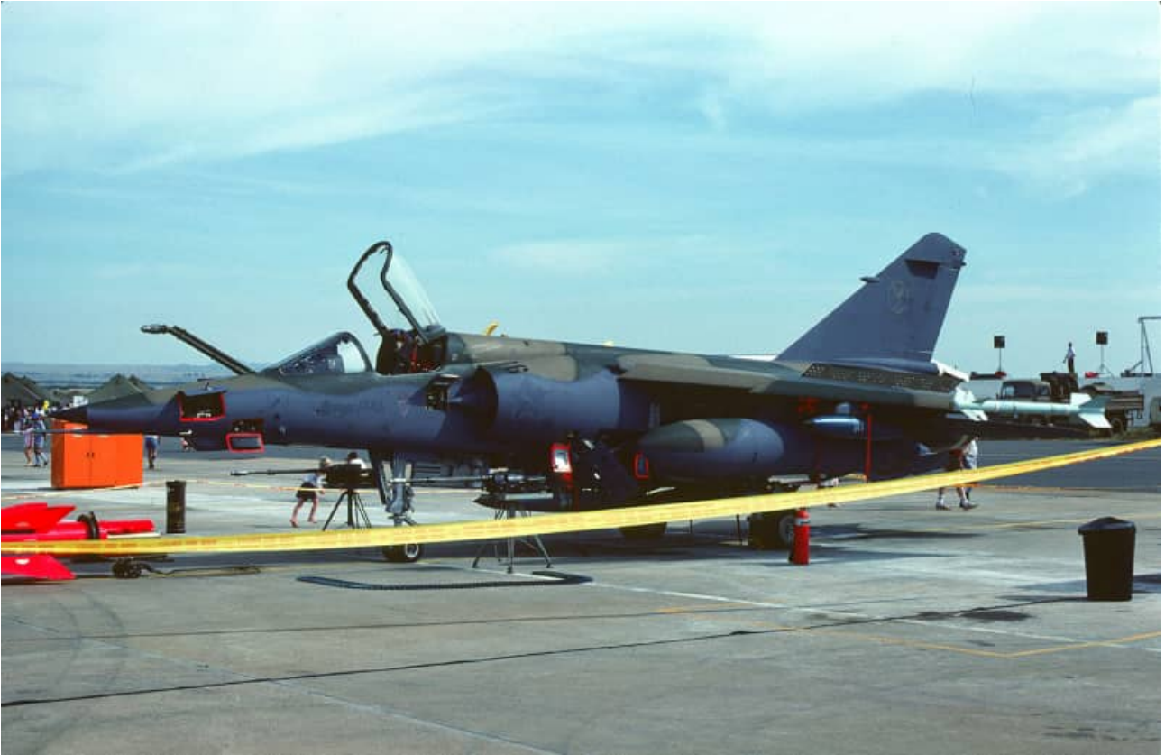
AZ #236 with blue Castles and low vis Springbok markings. The "36" digits on the intakes are in black and not dark grey. The spoilers are open on the port wing supper surface.