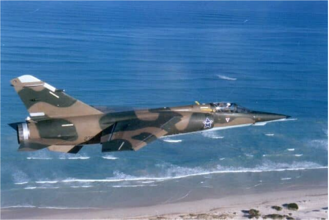
Two more views of AZ #235 post Project Nekwar modification. Note that it now carries the Castle / Eagle national markings – the Eagle having replaced the Springbok. It would appear that this was unique to #235 in the dark earth/green colour scheme. Note also that #235 now has a completely green starboard nose and anti-glare panel when compared to the upper image on the previous page. Note the full suite of aircraft markings and servicing symbology applied to the AZ in this camouflage scheme.