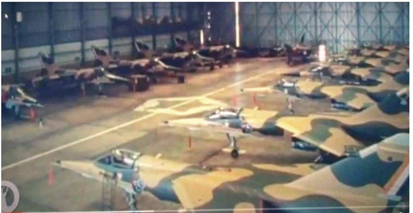
AZs in the hard-edge satin buff/dark green camouflage. The aircraft in the foreground is finished in pattern 2 whilst the next couple of AZs are in pattern 1. The fourth aircraft is a CZ. The AZ in the foreground has no squadron badge on the vertical stabilizer.