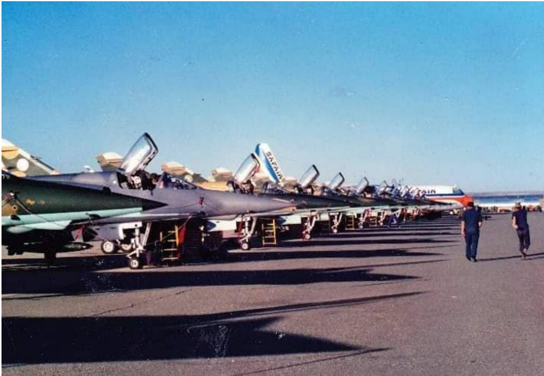
Another interesting image of several AZs displaying the various camouflage schemes as described in this document.