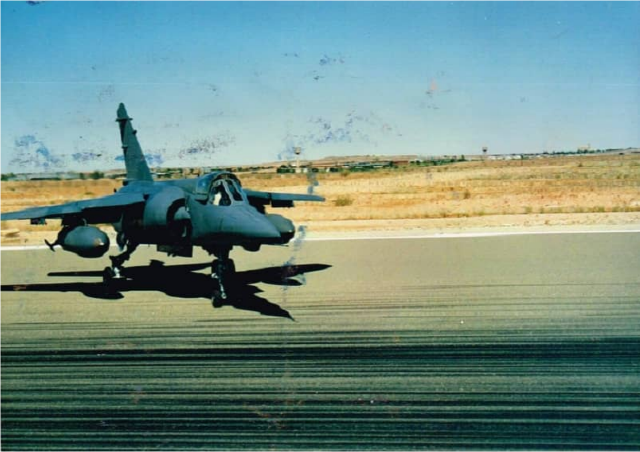
#243 at Upington in March 1987 during Exercise Golden Eagle.