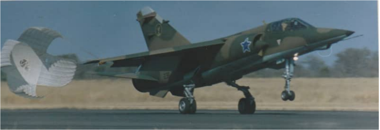
AZ #235 landing at AFB Grootfontein in August 1988. It carries the original Castle / Springbok national markings, but no black anti-glare panel on the upper nose. The dark earth colour has been partially carried over from the port nose on the upper starboard nose.

AZ #235 was later configured as the test airframe for the proposed F1 avionics upgrade project (Project Nekwar) which was ultimately not adopted for the AZ fleet. The image below is of #235 with post Project Nekwar modifications as can be seen by the revised RWS antenna on the leading edge of the vertical stabilizer, a white blade antenna on the upper fuselage and the additional small black antenna just adjacent to the drag chute cap on the starboard side. Formation strip lights have been added to the fuselage spine aft of the canopy, the upper rear fuselage and on the vertical stabilizer as can be seen in the image below. The RIMS ventral fins are installed. The UHF and IFF antennas on the fuselage spine remain in their original colours.