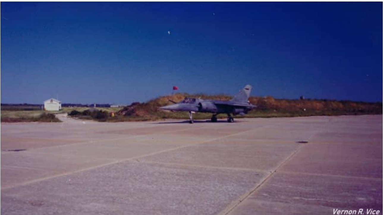
A well faded 244 at AFB Langebaanweg in February / March 1991 during an Air-to-Air gunnery camp. It is unclear if the aircraft has been equipped with RIMS ventral fins.