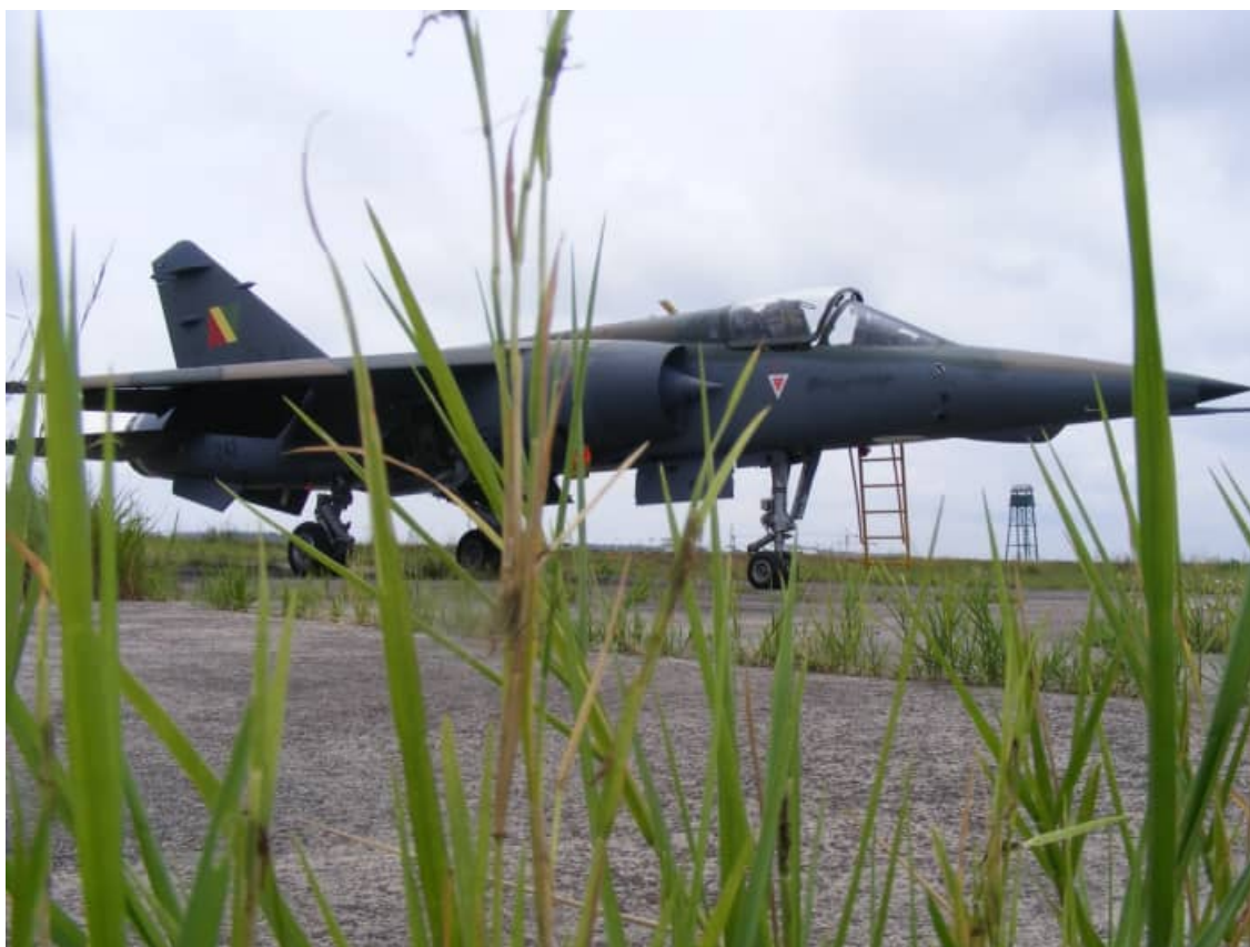
AZ #243 / TN-363. Note the difference in national markings on the vertical stabilizer compared to #230 above.