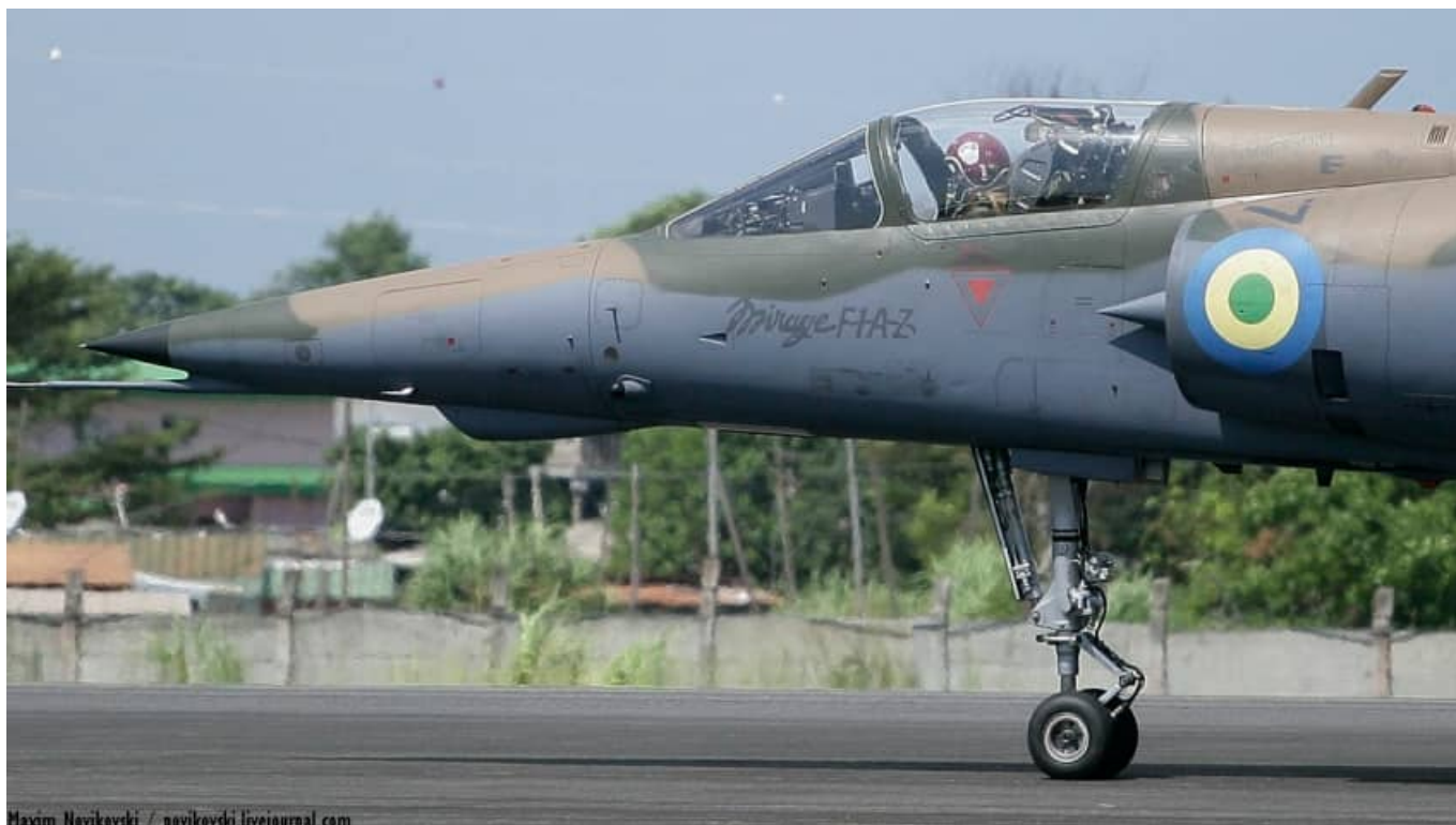
AZ #217. This would be given the Gabonese registration TR-KMP which would be applied to the vertical stabilizer.