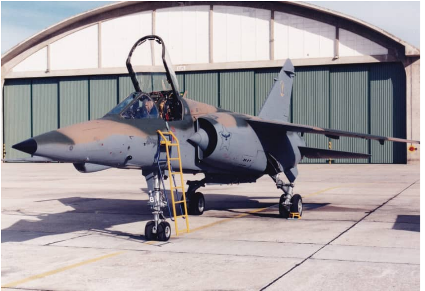
Low visibility Castles with dark grey edges and SAAF Eagle as can be seen on AZ #218 above and #219 below.