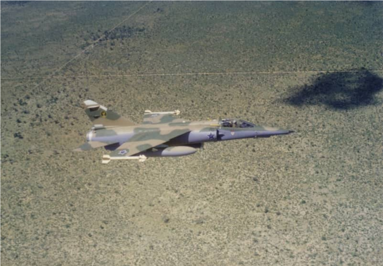
More views of AZ #220 flying over Southern Angola. The improvement of the scheme compared to the standard buff/dark green scheme is clearly evident.