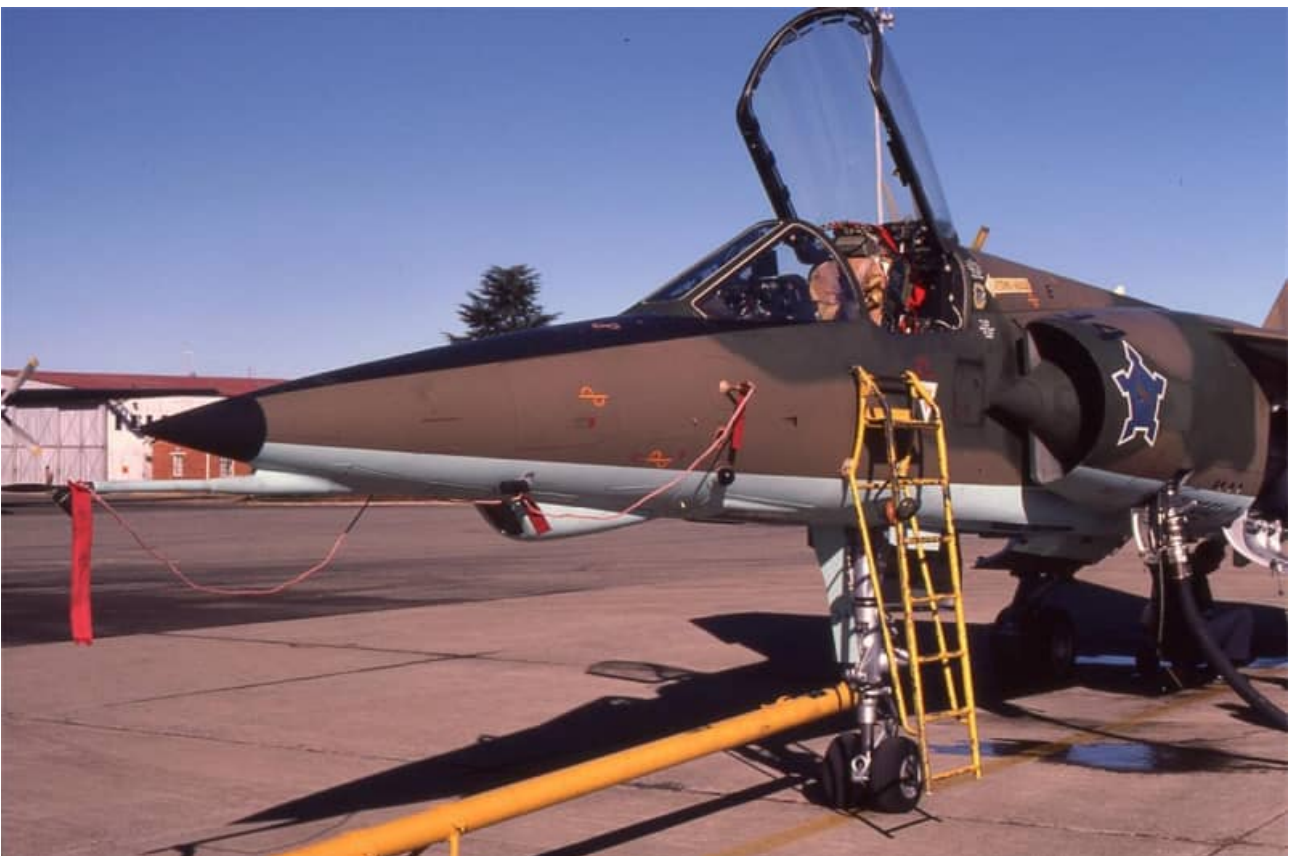
AZ #234 resplendent in a fresh coat of dark earth/green and pale blue undersides grey. Full colour markings have all been retained in this scheme.