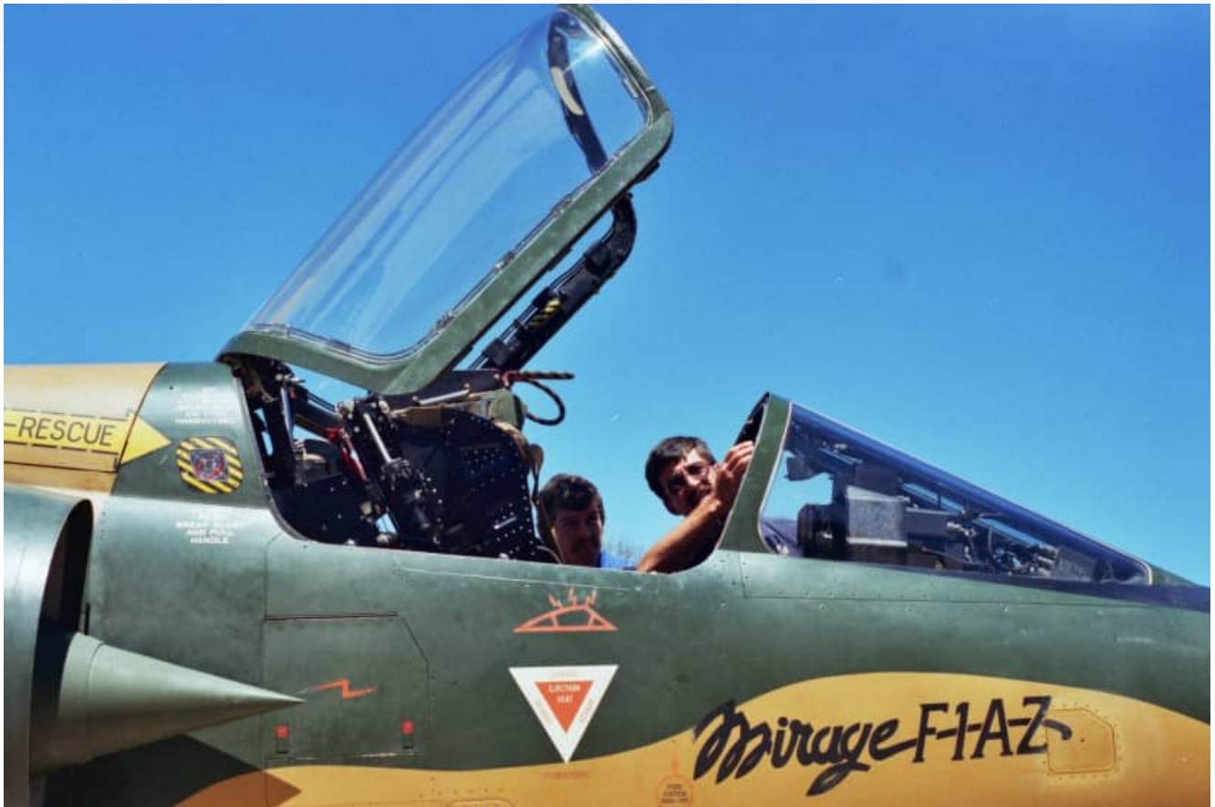
AZ nose area in detail. The elongated intake cone or "mouse" which was fitted to the SAAF Mirage F1s is visible in these images. This necessitated the very front portion of the cone to be hinged to allow the panel behind to be opened.