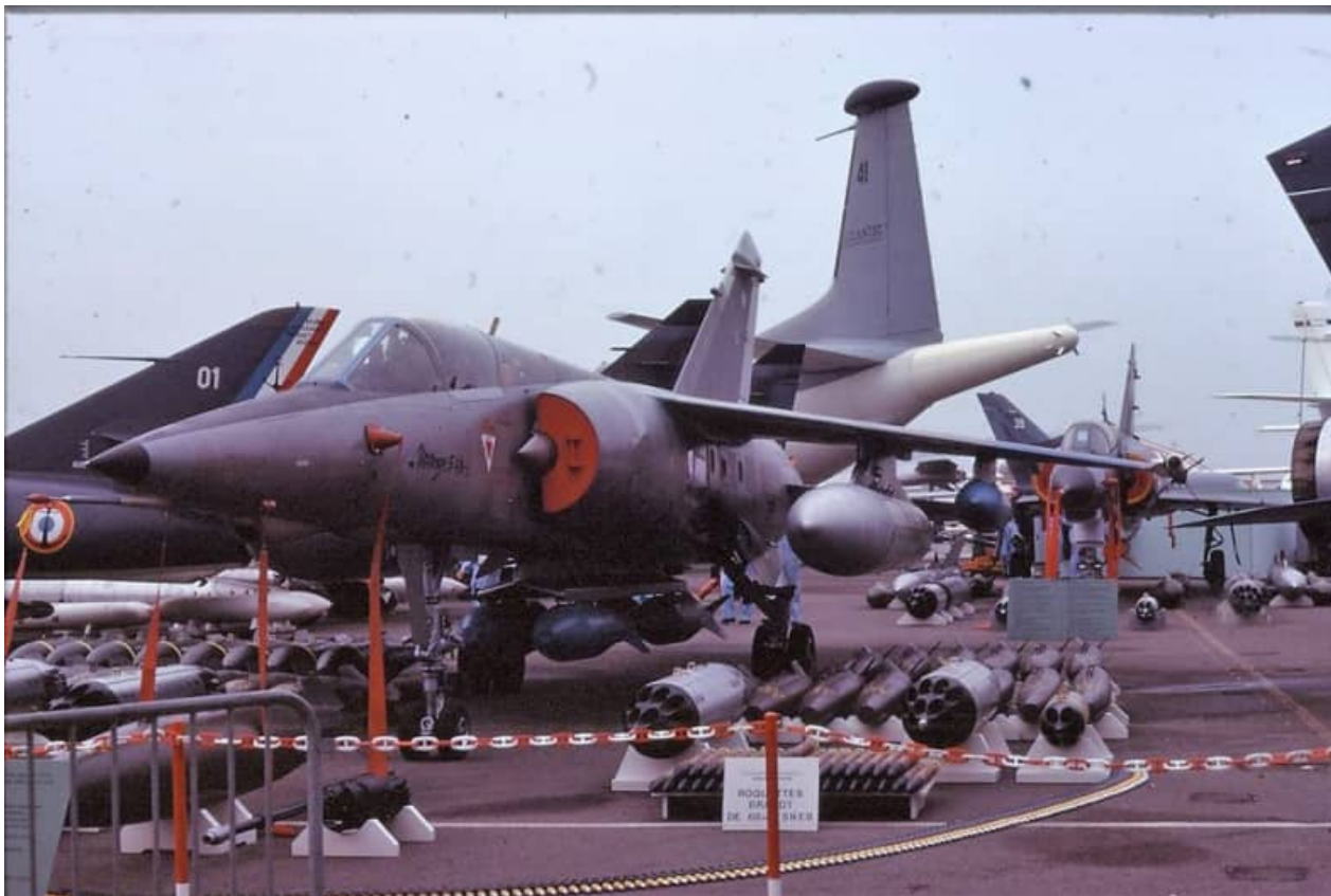
Unpainted AZ #216 at the Paris Air Show with a variety of weapons displayed on and beneath it.

Two images of AZ #216 during testing in France prior to application of the buff/dark green/light grey delivery camouflage. #216 is unpainted except for the black ranging radar cover and anti-glare panel ahead of the windshield.