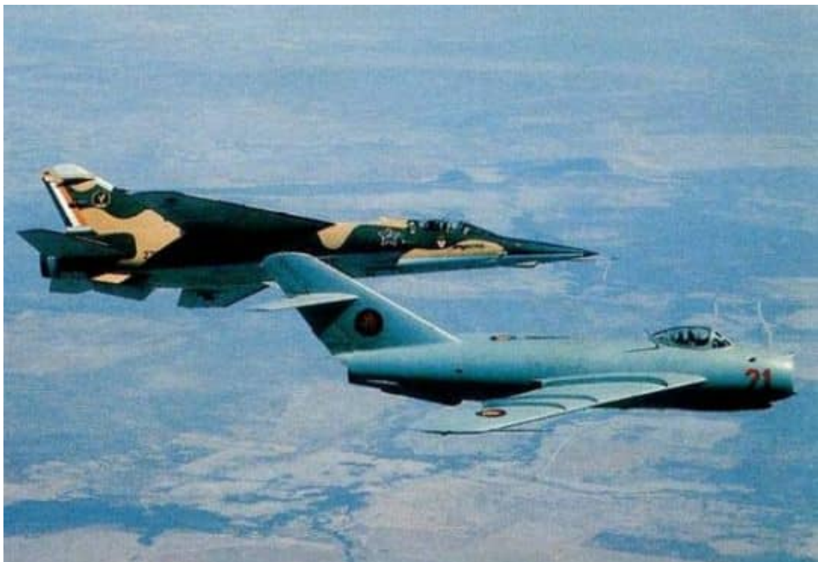
AZ with the Mozambique Air Force Mig-17 which was flown to South Africa by a defector.