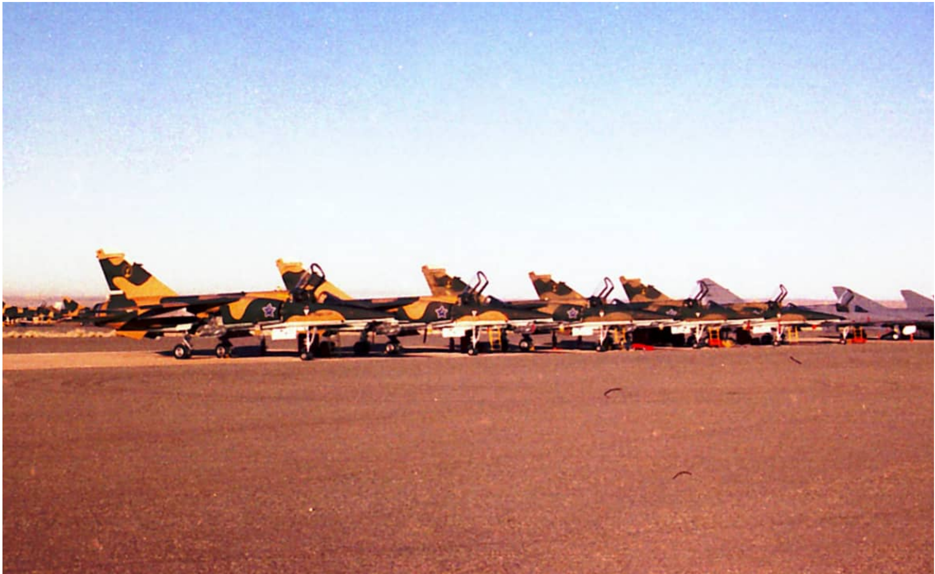
Upington, June 1989. The first and second aircraft are in the original hard-edge buff/dark green camouflage with high visibility markings. The third AZ has what appears to be a very feathered matte dark earth/green camouflage (look at the vertical stabilizer). The green on the vertical stabilizer does not carry onto the rudder indicating this AZ is possibly one of the first to have had the initial test interim dark earth/green scheme applied. The next two AZs carry the dark earth/green camouflage scheme but with the demarcation between these colours is a more tightly feathered and with the green carried through onto the rudders. However, compare the noses of these two – the closest one shows the dark earth wrapping around from the port side and does not have the black anti-glare panel applied, whereas the next one appears to be all-green with black anti-glare panel. The sixth AZ is #243 painted in an experimental two tone grey. The rest of the aircraft are Cheetah Es going by the shape of the top of the vertical stabilizers and the overall medium blue-grey camouflage. Only one of the AZs displays the 1 Squadron badge on the vertical stabilizer.