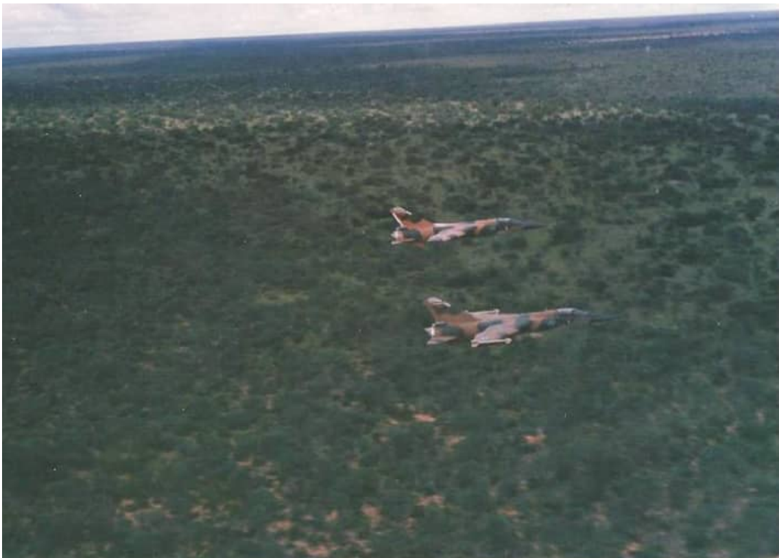
Another view of the comparison flight. It is evident how much the nutria brown on the lower aircraft shows less contrast with its surroundings than the standard buff on the other AZ.