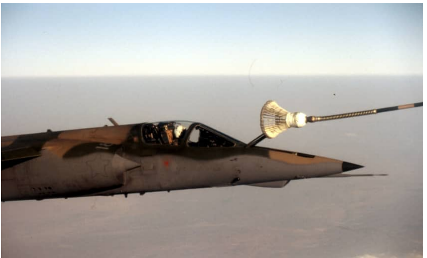
AZ #218 receiving fuel from the Boeing 707.