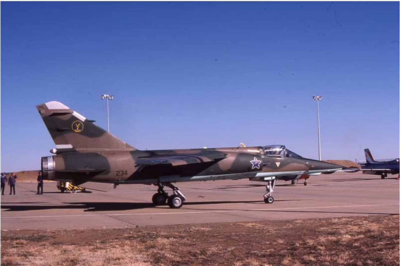
AZ #234, also at AFB Bloemspruit in July 1989. In this case the rescue arrow is clearly visible aft of the canopy.