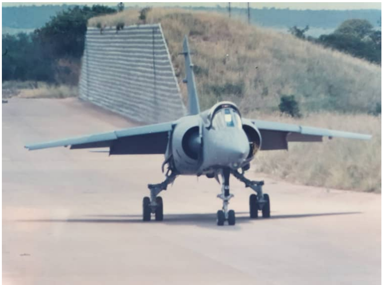
Another forward view of #243. Note the last two digits of the aircraft tail number applied in white. The aircraft is in a pre RWS and RIMS mod state.