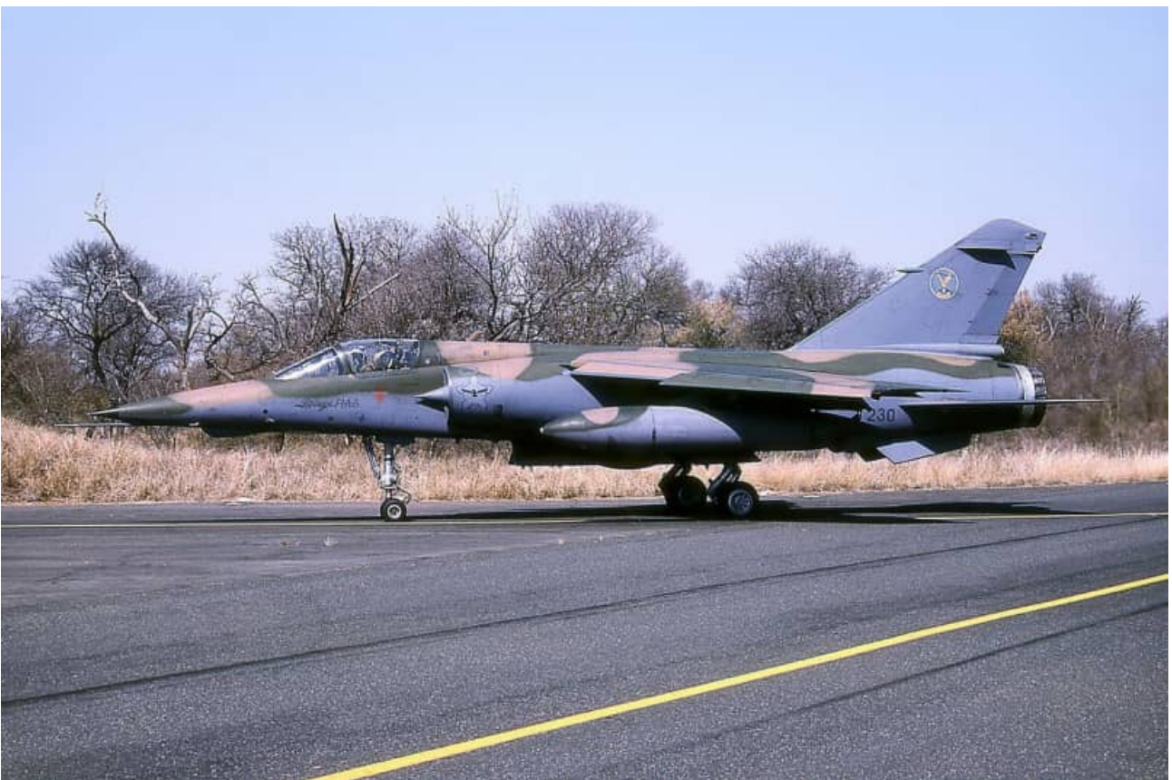
AZ #230. The Castle appears to be a lighter grey than usual.