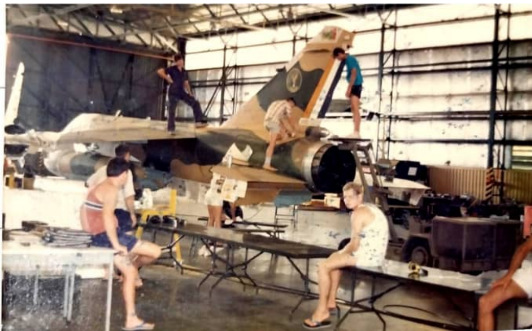
Not quite your typical clean room paint shop. An AZ is being prepared for colour modification in the Grootfontein hangar.

Without a formal and approved Engineering Change Proposal (ECP) having been issued to repaint the aircraft, this could have had serious consequences, but with the very positive results from flight trials, sense prevailed at SAAF HQ. Although camouflage development for the AZ was initially viewed as a low priority, virtually overnight, a formal and high-priority ECP was raised to develop a new paint scheme for the aircraft. In the interim, while the Squadron was still at AFB Grootfontein, permission was granted to repaint four aircraft. Photo evidence shows at least two AZs were repainted at AFB Grootfontein before the Squadron was temporarily stood down on 2 March 1988. These aircraft can be identified in the following images by the having the entire rudder painted in nutria brown.