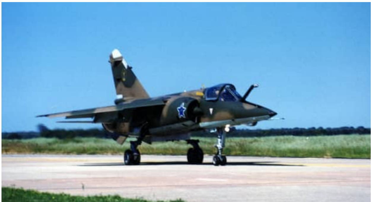
AZ #224 seen at Langebaanweg in 1991. #224 has both RWS and RIMS systems installed. Note the dark earth patch on the starboard nose which can also be seen on #235, #241 and #242 in later images in this section. This is once again proof of how variably the camouflage could be applied.