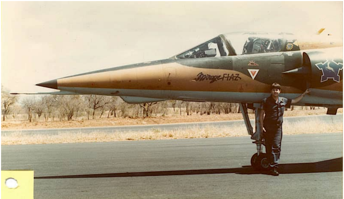
Details of the front area of the AZ. The aircraft above is pre-RWS mod state. The flat rectangular Doppler antenna can be seen on the underside just aft of the laser designator fairing. The yellow antenna in the fuselage spine is the main UHF antenna.