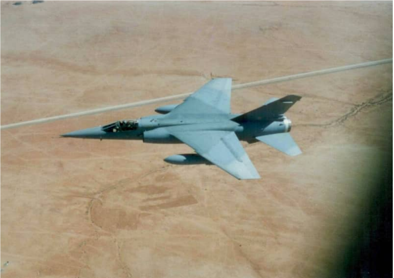
AZ #244 viewed from above. This aircraft carried an unmodified version of the air-superiority scheme developed for the CZ. While very effective at altitude where the CZ typically operated, it wasn't as effective at lower altitude where the AZ typically operated. #244 has been modified with the RWS as witnessed by the small RWR antennas on the nose and the upper vertical stabilizer.