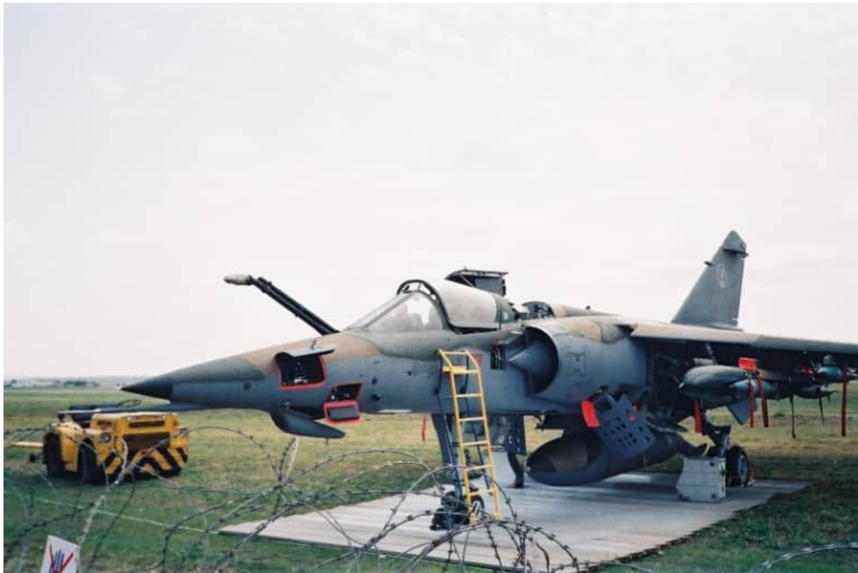
AZ #2xx. Note that all open hatches have been painted / framed with a high visibility orange colour.