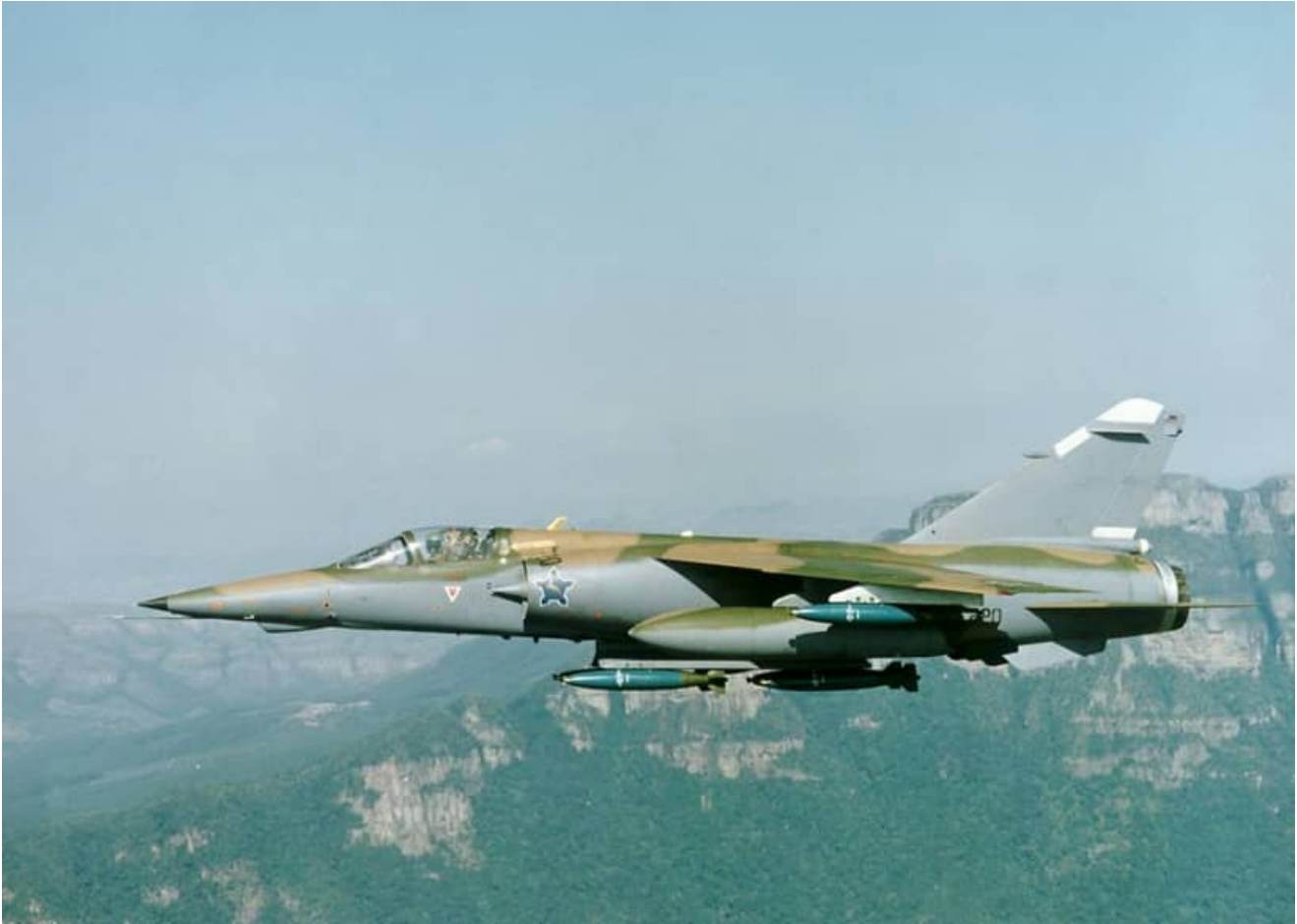
Another view of 220, with six inert Mk.82 bombs, is seen over the Drakensberg Mountains near AFB Hoedspruit. More details to note are that the main UHF blade antenna is yellow on the fuselage spine, and the upper IFF antenna is white. The aircraft is equipped with the upgraded RWS, but not with RIMS.