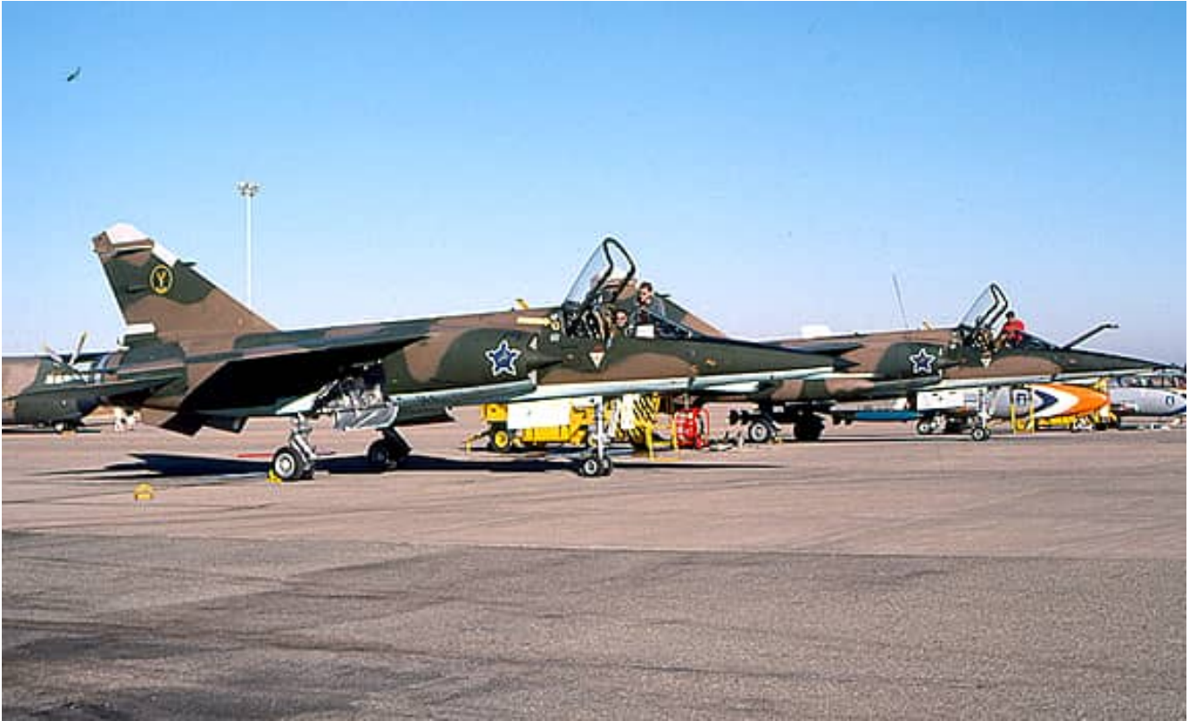
AZ #234 (foreground) and #231 seen at AFB Bloemspruit in March 1989. Both are finished in the factory applied dark earth/green/pale blue camouflage scheme. Both aircraft have the black anti-glare panel painted on the noses. Note the subtle differences in markings - #234 has the yellow rescue arrow marking present aft of the canopy, whereas #231 does not. The IFF antenna on the spine of #234 is painted white, whereas on #231 it is a darker colour. Note the differences in the dark earth/green demarcation lines on the noses of the two aircraft. There also appears to be a tonal variation in the brown colours between the two aircraft.