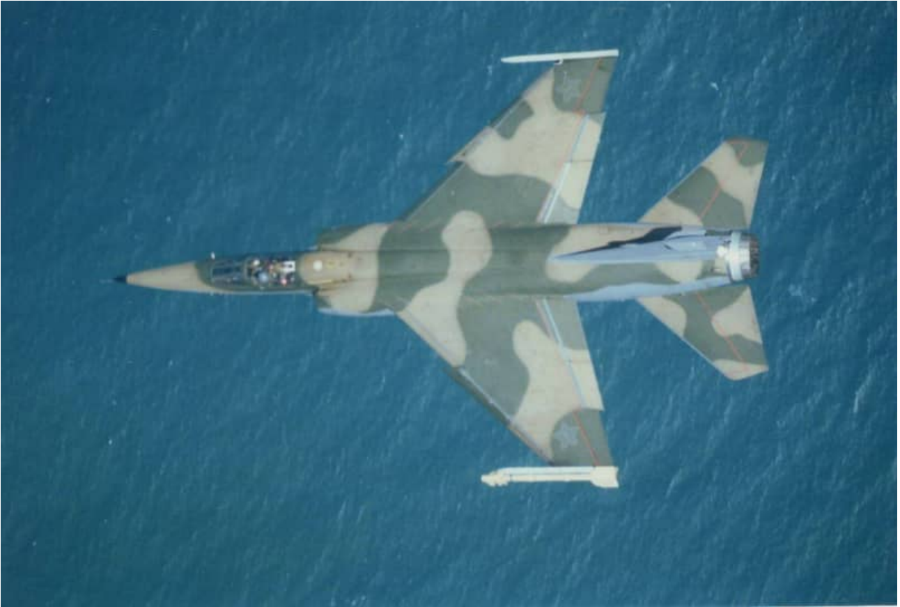
Top view of an AZ in the final colour scheme. Note that the camouflage has been applied in a manner similar to the original pattern 2. This AZ does not have green applied to the front of the nose. The walkway lines on the wings and the horizontal stabilizers have been applied in red instead of the more standard dark grey. The wingtip missiles are V3Bs and the launch rails are in light grey.