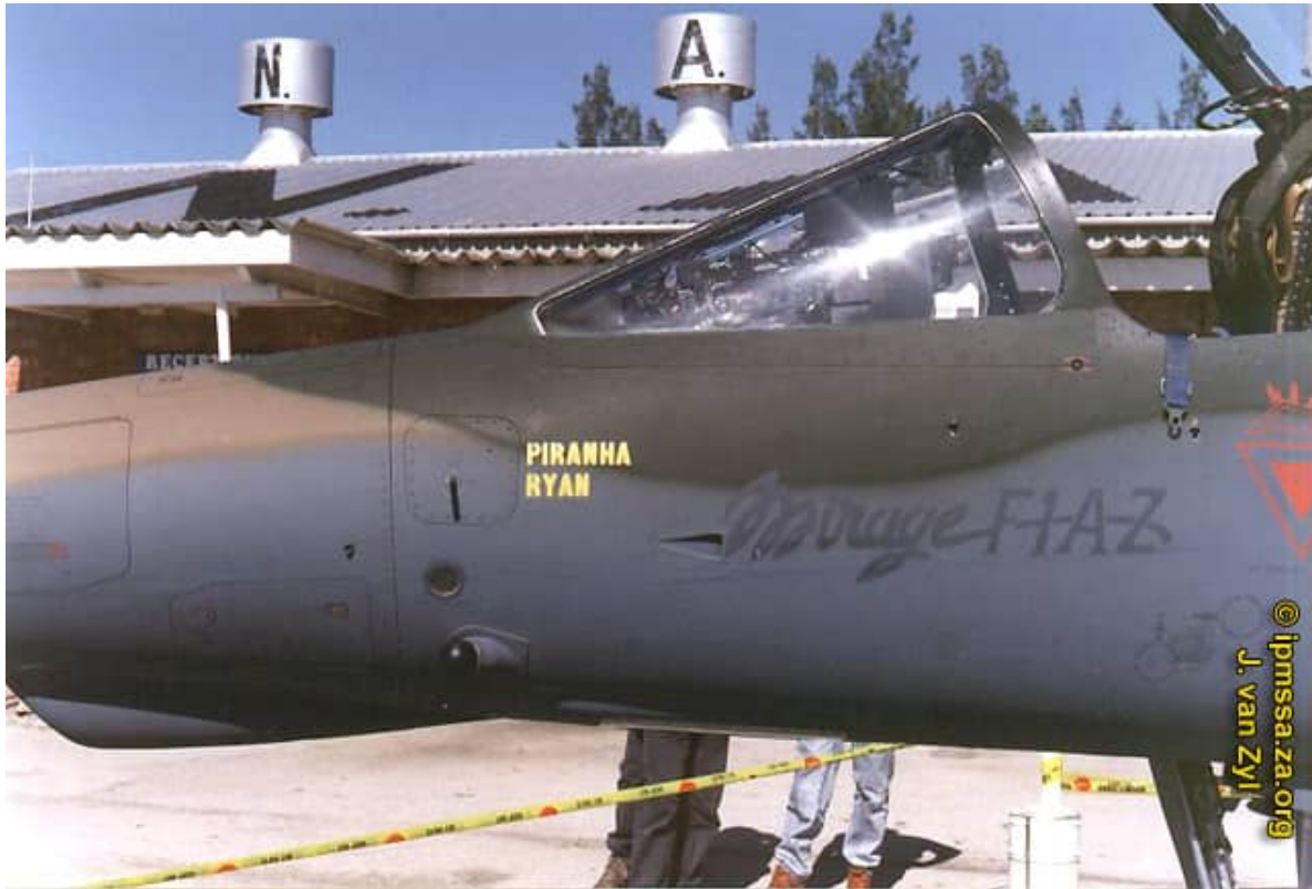
Nonstandard yellow call signs / pilot names were applied to the AZs in the final months of their service. Note the forward RWS antenna and the shape of the laser designator fairing. The round object above the RWS antenna is the crash-tow tube. A rod could be put through this to lift / tow an aircraft if required. Light grey doppler antenna is visible on the lower surface aft of the laser designator fairing.