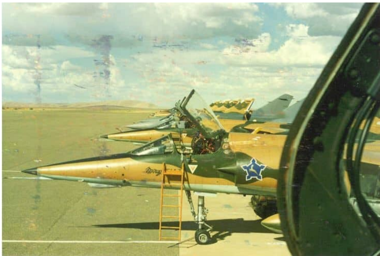
Both #243 (furthest from camera) and #244 (closest to camera) can be seen on the AFB Grootfontein flight line during 1987 in their respective low visibility camouflage. Note the slight difference in colour between #244's PE Blue and #243's darkened grey on the vertical stabilizers.

#243 and #244 carried their experimental schemes into the early 1990s and would eventually be repainted into the final camouflage scheme as carried by the AZ fleet.