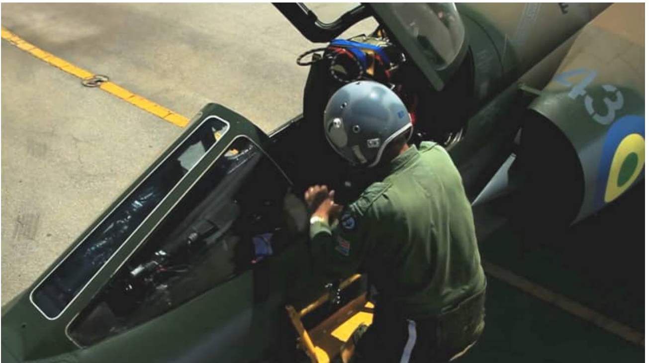
AZ #243 / TR-KMQ