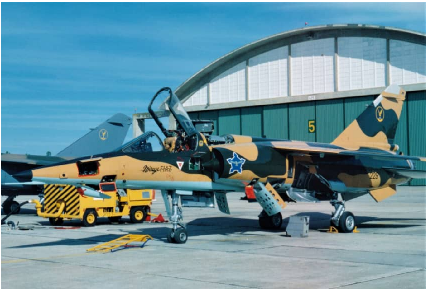
Yet another image of #229 – quite a popular photography subject, most probably due to its existence as a test and solo air display airframe. There are several service panels opened - note the high visibility orange colouring to the panels. The rudder is camouflaged and the SAAF Eagle is present. #229 remained in this colour scheme until its retirement and appeared to be immaculately maintained with a nice satin finish.