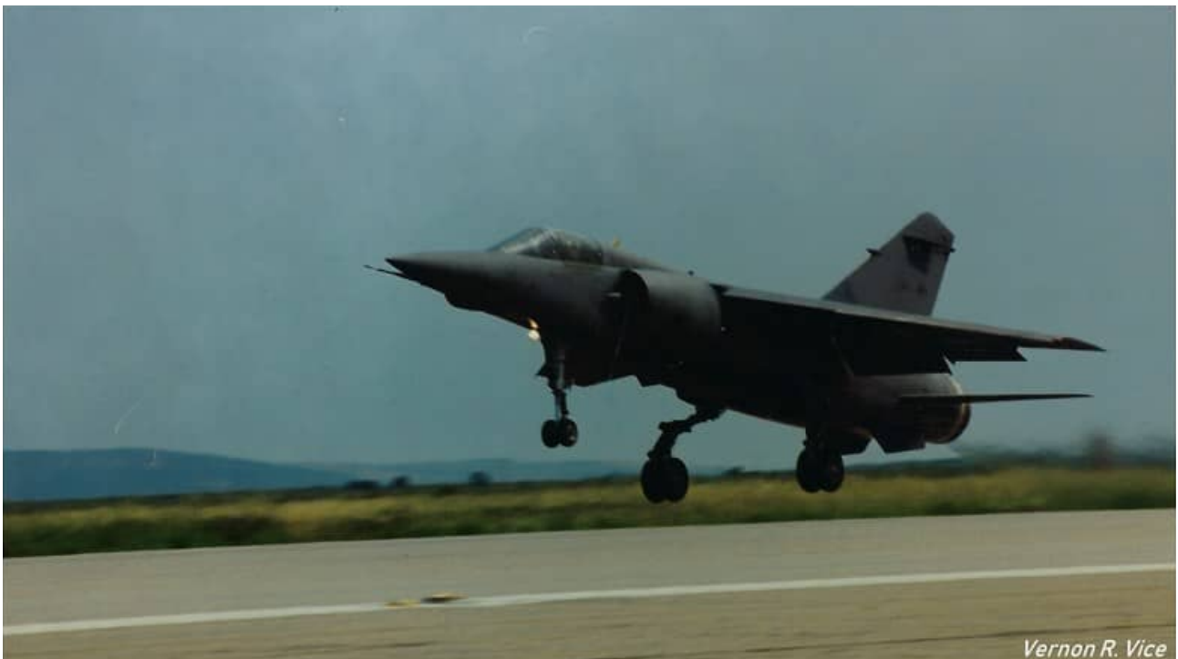
#243 during an Air-to-air gunnery camp at AFB Langebaanweg in February / March 1991. She is in the post RWS and RIMS mod state.