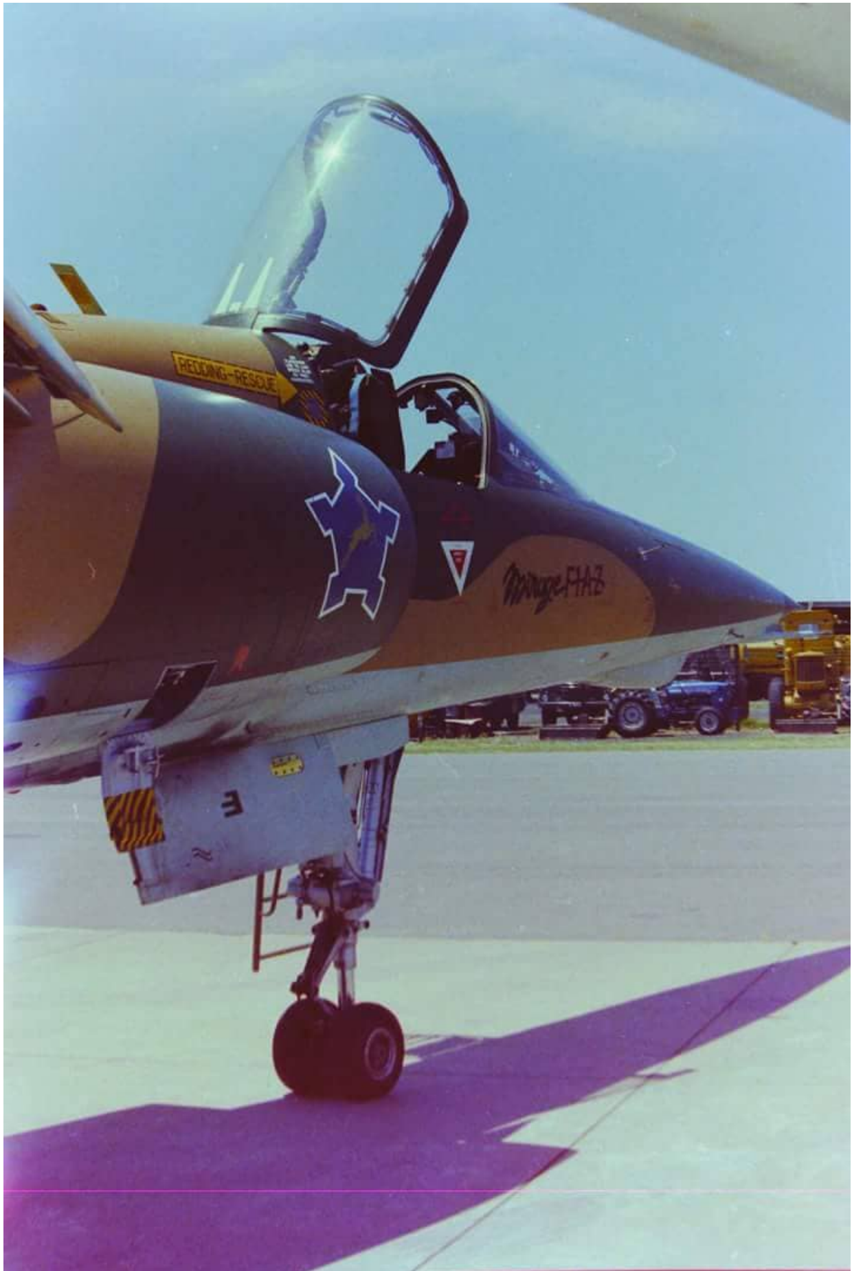
Details to note – yellow/black striped access door. The yellow blade antenna on the nose gear door is the lower IFF antenna. There was another located on the fuselage spine. Leading edge flaps are in the lowered position. The small probe near the nose is a pitot probe and is present on both sides of the nose. The other probe just ahead of the "Mirage F1AZ" text is the temperature probe. The large blade antenna on the spine aft of the canopy is the main UHF antenna. Aft of that is a red navigation light.