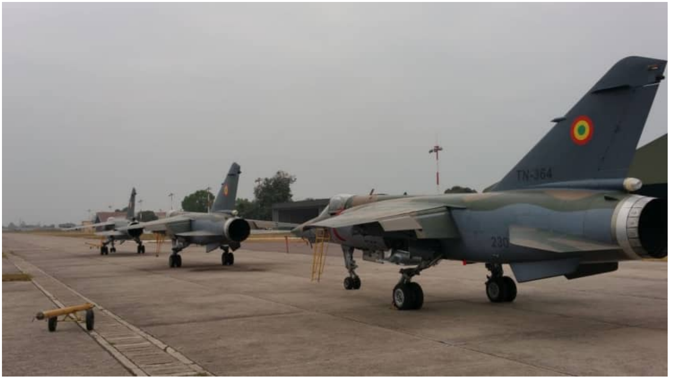
AZ #230 / TN-364 and two others.