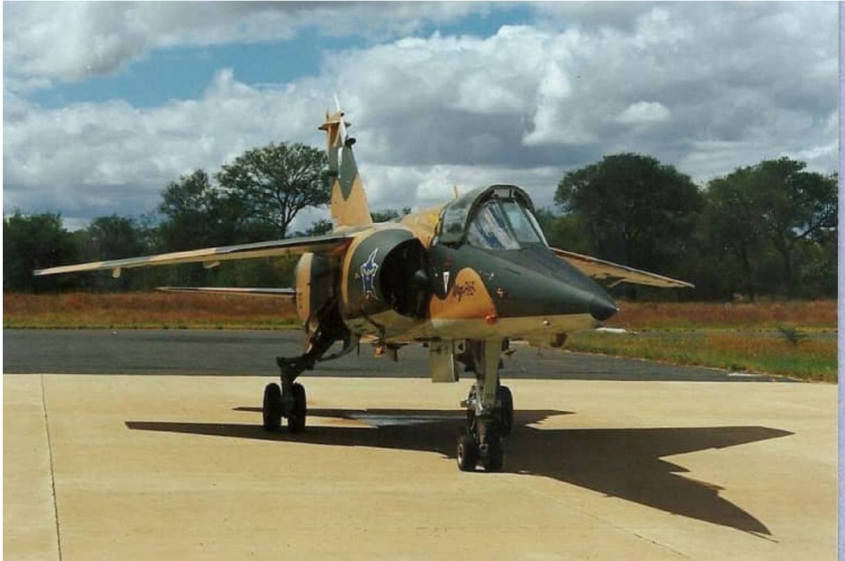
Two images of AZs #233 above and #229 below. #233 has the TFDC badge on the vertical stabilizer and the Castle with SAAF Eagle on the intake. #229 has the 1 Squadron badge on the vertical stabilizer and the original Castle and Springbok on the intake. Both aircraft have had the RWS installed, but #233 above has two non-standard black antennas located on the leading edge of the vertical stabilizer (as is indicated in other images provided elsewhere in this document). Note how the original camouflage on #229 has faded and weathered.