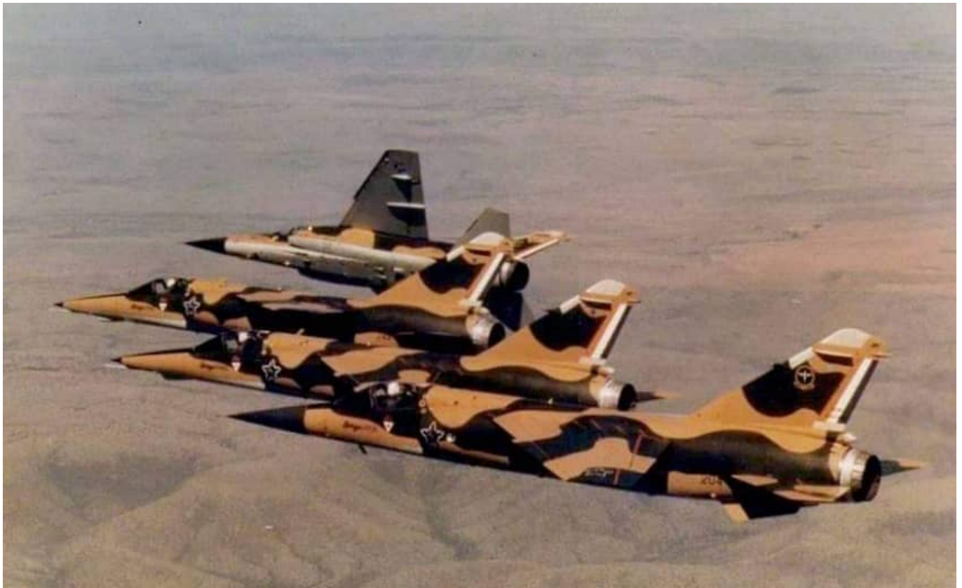
Two AZs in company of two CZs. The AZs appear to be in the Pattern 2 scheme - note how the dark green paint on the fuselage spine ahead of the vertical stabilizer wraps over to the starboard side of the fuselage. However, there are some subtle differences in the AZ patterns; for example, look at the slightly different application of dark green along the rear fuselage. All other markings are similar for all four aircraft with the exception that the AZs have no squadron badge on the vertical stabilizer.