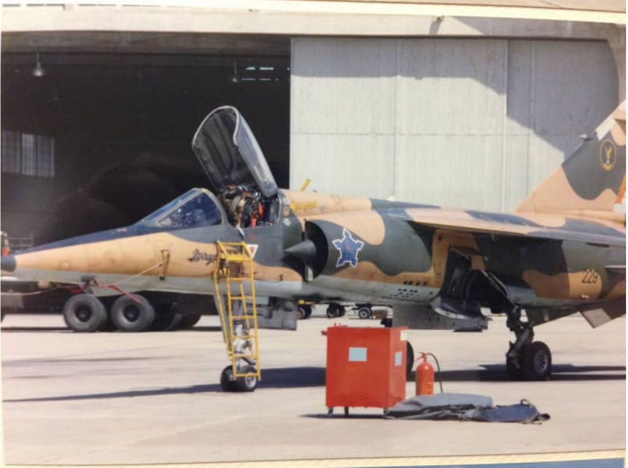
Two more images of #229. In the image below, the round laser designator can be seen in the housing beneath the nose. Note how the camouflage wraps around the underside of the wing and horizontal stabilizer leading edges.