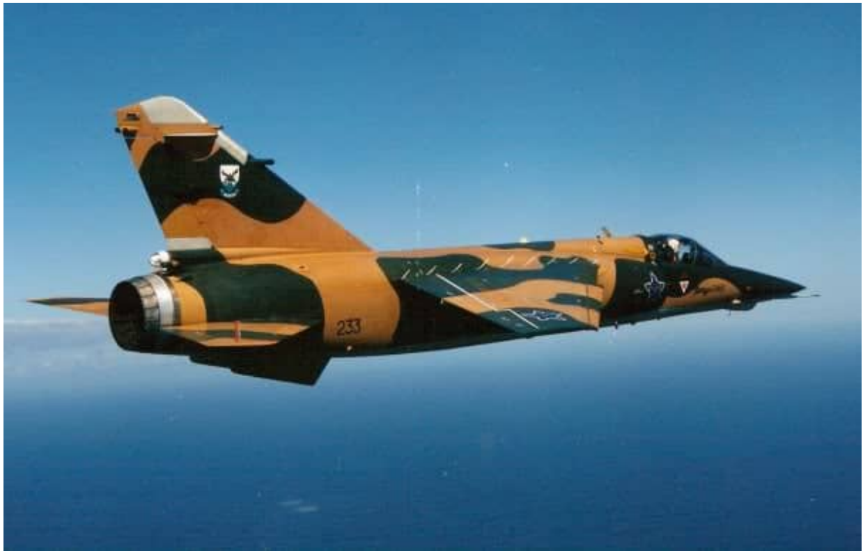
AZ #233 was one of the TFDC (Test Flight and Development Center) aircraft based at Bredasdorp in the Southern Cape. Note the TFDC badge on the vertical stabilizer. #233 is painted in the standard pattern 1 hard edge buff/dark green camouflage scheme with high visibility markings. However, the Springbok has been replaced by the SAAF Eagle in the Castles. The red markings on the wings and fuselage appear to have either faded or have been painted in white. Those on the horizontal stabilizer are in bright red. Note that there appear to be two RWR antennas on the leading edge of the vertical stabilizer. The larger one is of a different shape to the original conical configuration.