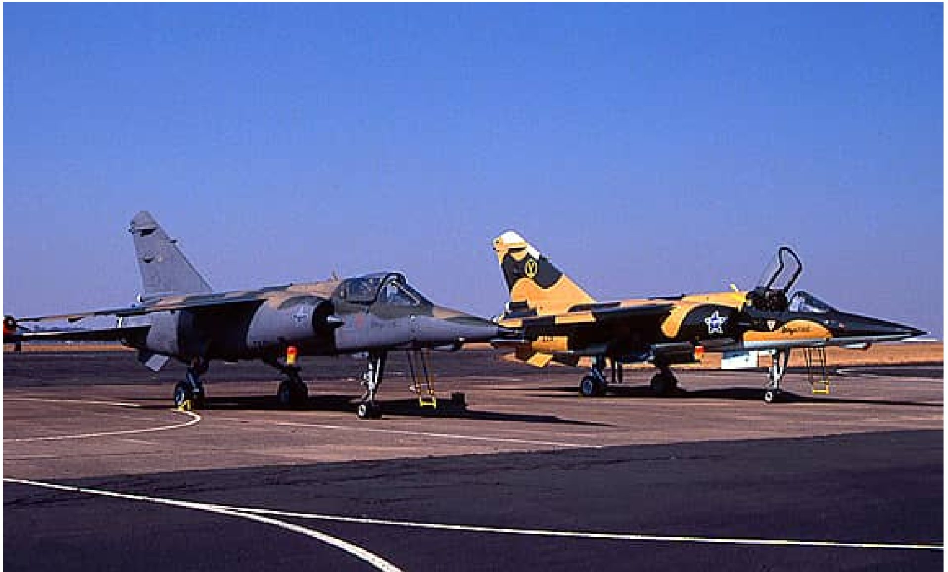
Great image demonstrating a comparison between the original delivery buff/dark green (AZ #229) color scheme. #229 was the 1 Squadron display aircraft and received a gloss finish to the camouflage colours. The high contrast, high visibility buff/dark green is apparent when comparing to the final matte scheme. Note the distinct difference in the tone of the greens applied to the two aircraft. Both aircraft have the SAAF Castle with SAAF Eagles. It is possible that this image was taken at the AZ retirement parade.