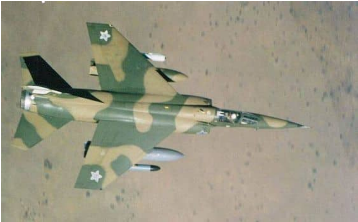
AZ #241. The camouflage scheme is the same as AZ pattern 2 used for the earlier hard-edge buff/dark green camouflage. The last two digits of the tail number, "41" appear in larger black numerals on the upper surfaces of the intakes. The red stripes have been removed from the wings, elevators and wing/fuselage junction. Unlike #240 on the previous page, #241 does not have the black anti-glare panel ahead of the windscreen. The VHF, UHF and ILF/VOR antennas on the vertical stabilizer remain in light grey. The external fuel tanks are painted differently – one dark earth/green and the other in a medium blue-grey 8 . The store on the port outer wing is an ELT-555 EW jamming pod whilst the store on the starboard outer wing appears to be an H2 bomb guidance pod. The AZ would carry the H2 on the fuselage pylon.