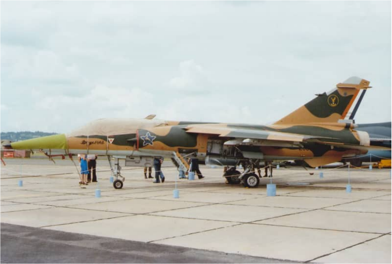
Beautifully turned-out AZ at an airshow. Standard high visibility markings are present. The wing external stores pylons have been installed. The interior of the main landing gear bays are painted silver.