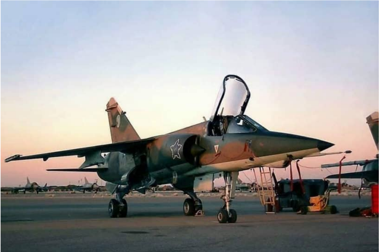
AZ in the matte soft edge dark earth/green camouflage with a hard-edge demarcation between the upper and lower colours – note that the whole rudder is painted in dark earth indicating this to be one of the initial aircraft trialed with the dark earth replacing the buff. It has a black anti-glare panel ahead of the windshield. Some of the original high visibility markings were retained including the blue Castle with gold Springbok and 1 Squadron badge. Other markings such as the "Mirage F1AZ" on the forward fuselage and the rescue arrow aft of the canopy have been over sprayed with dark earth.