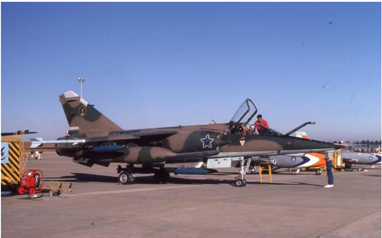
Closer view of #231. The green on the rudder appears somewhat darker, possibly indicating a later touch up. The rescue arrow aft of the canopy has been overpainted with nutria brown or dark earth. The red "keep-off" lines of the wing-fuselage fairings are vaguely visible on the green painted wing to fuselage fairings but are not on those that were overpainted in brown. These are possible indicators that this may be one of the initial AZs to have been painted in the nutria brown with later touch ups added such as the green on the rudder.