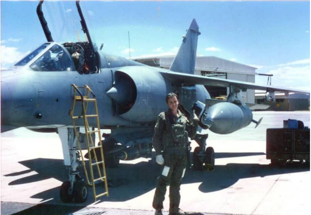
244 at AFB Grootfontein loaded with four Mk. 82 bombs.