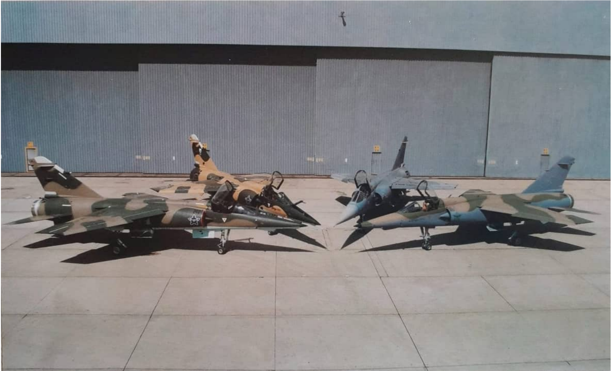
Here's a great image of the four Mirage F1 colour schemes. All four are Atlas Aviation aircraft taken in 1996. From left to right – AZ #235 in the interim dark earth/green/pale blue, AZ #233 (note TFDC badge on vertical stabilizer) in the original hard-edge buff/dark green/light grey camouflage (pattern 1), CZ #209 is representative of the 3-colour low-visibility camouflage as carried by #244 and unidentified AZ in the final dark earth/green/blue-grey camouflage