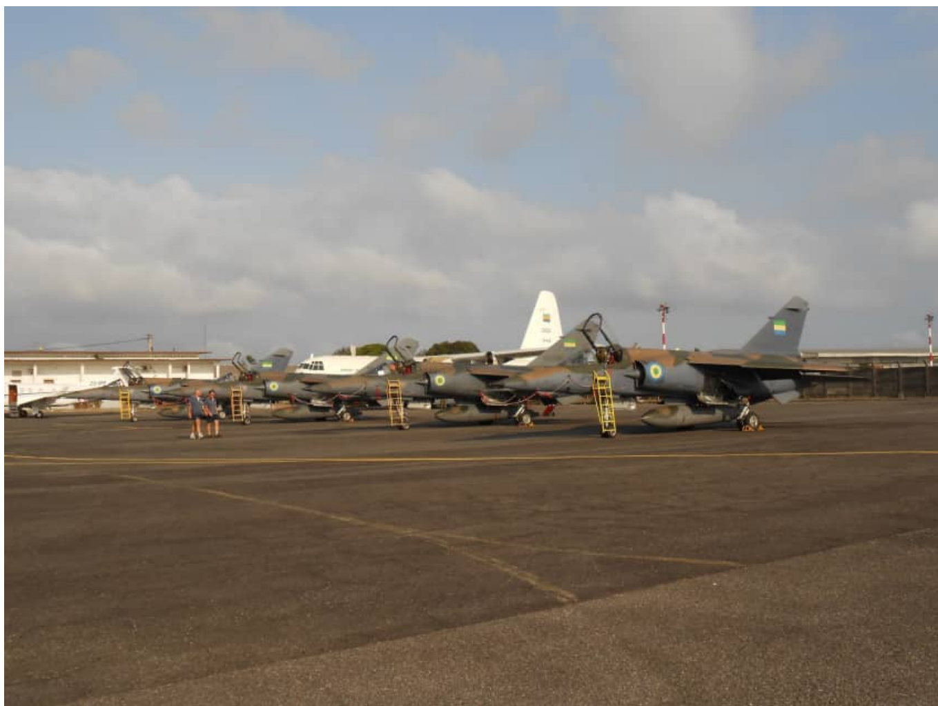
Four Gabonese Air Force AZs