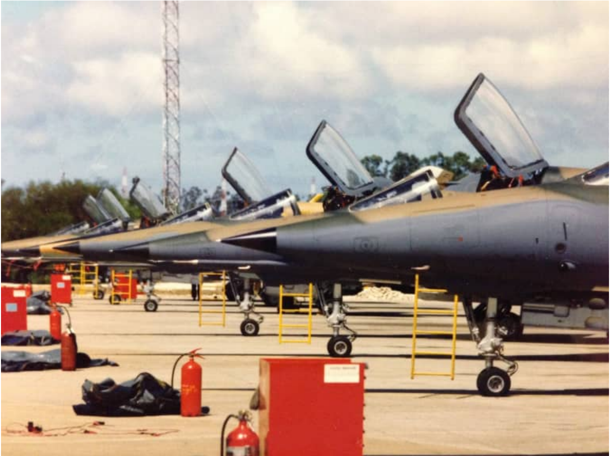
A nice selection of AZs. The first three and last aircraft are in the final dark earth/green/blue-grey camouflage. The 4 th aircraft is in the original buff/dark green/pale blue camouflage. Note that the 3 rd aircraft does not have the green colour on the nose, unlike the first two. The second and third aircraft have blue-grey canopy frames.