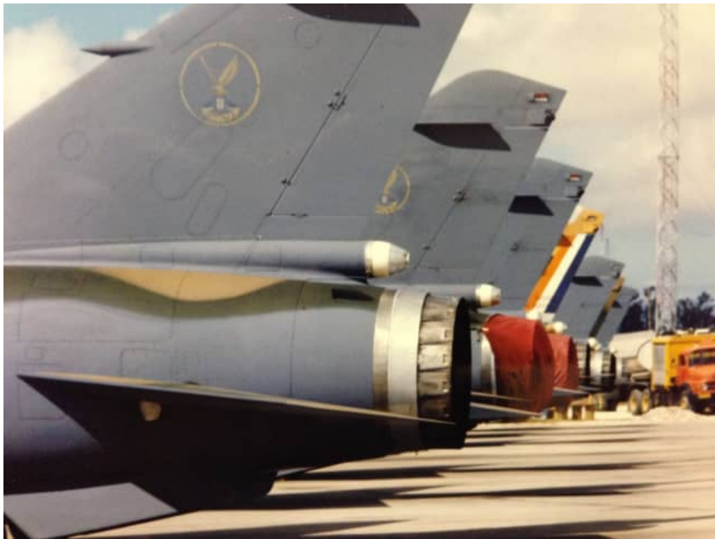
Most probably the same lineup of aircraft as in the first image on this page. All aircraft are post-RWS mod state as can be seen by the RWS antennas on the top trailing edge of the vertical stabilizers. The 6 th aircraft is painted in the interim dark earth/green/light grey camouflage going by the colours on the vertical stabilizer.