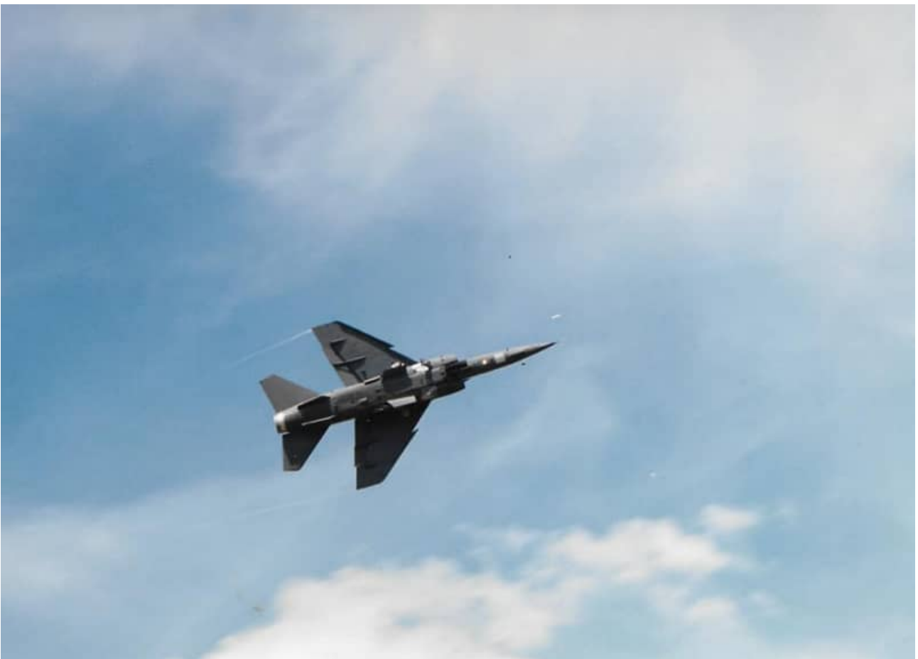
No Castles on the lower wings.