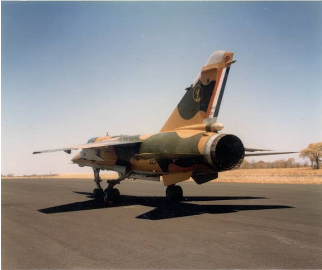
Two images of AZ #223. Note the faded appearance of the buff/dark green camouflage. The yellow marking on the wing in the image below is the standard NATO symbol for lifting point. This appears to be pattern 1 – green inboard section of leading-edge slat.