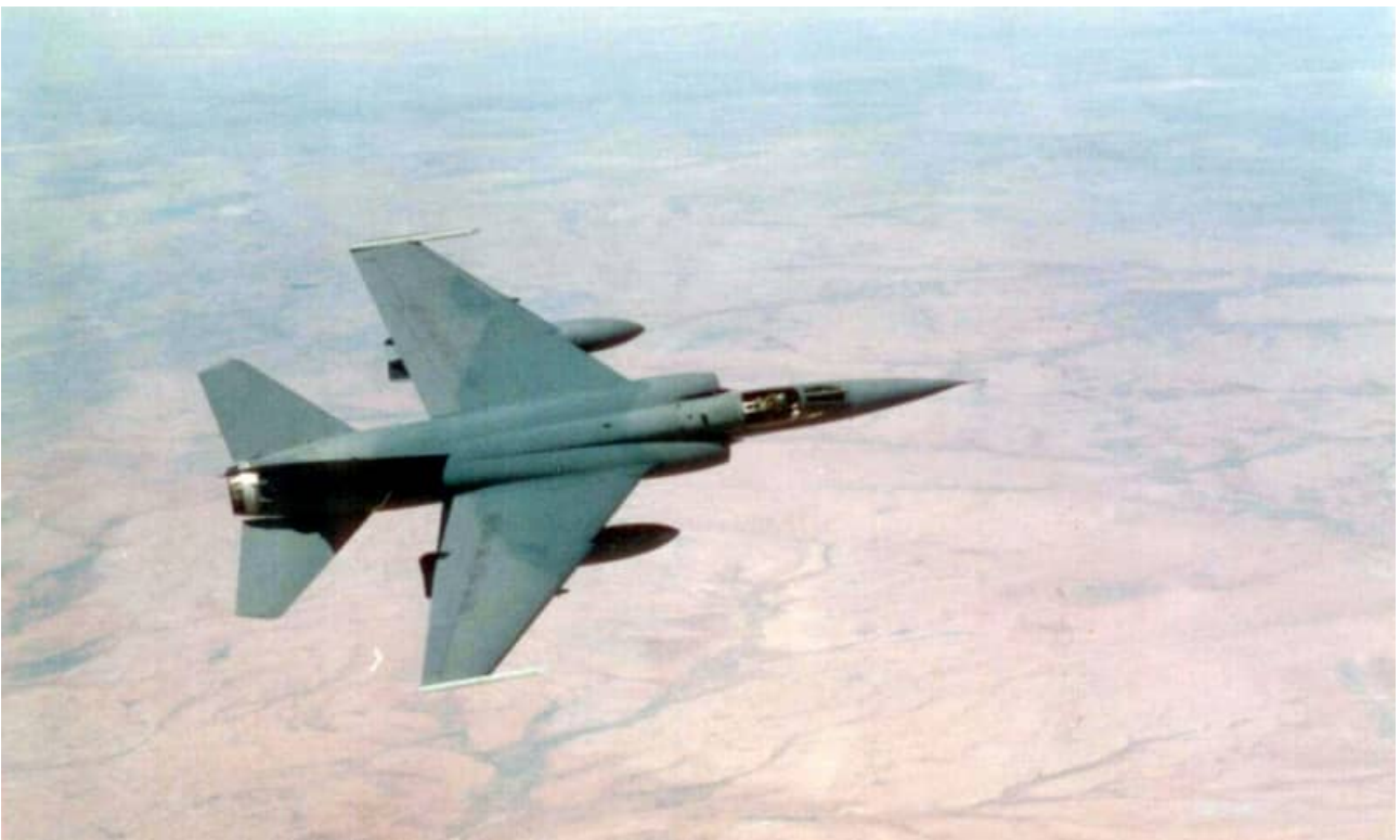
AZ #243 when viewed from above in the simplified 2-colour camouflage. The darker overall appearance of the scheme is very apparent. Also note the change in shape of the dark Mirage Grey diamond. The additional "half-moon" shape on the port wing leading edge is the result of an accidental spillage during painting as noted by Digby Holdsworth, SAAF Project officer. Note that, unlike #244, #243 has not yet been fitted with the upgraded RWS.